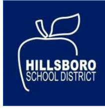
Training Agent (TA): Hillsboro SD