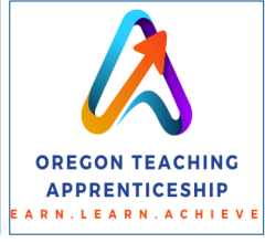
Oregon JATC Presents for the NCGYO Network