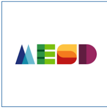
Multnomah ESD Training Agent (TA)