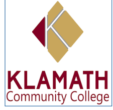
Related Training Provider (RTP): Klamath CC