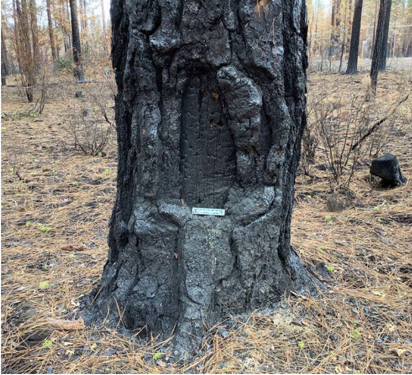
Figure 11. Example of peeled pine.