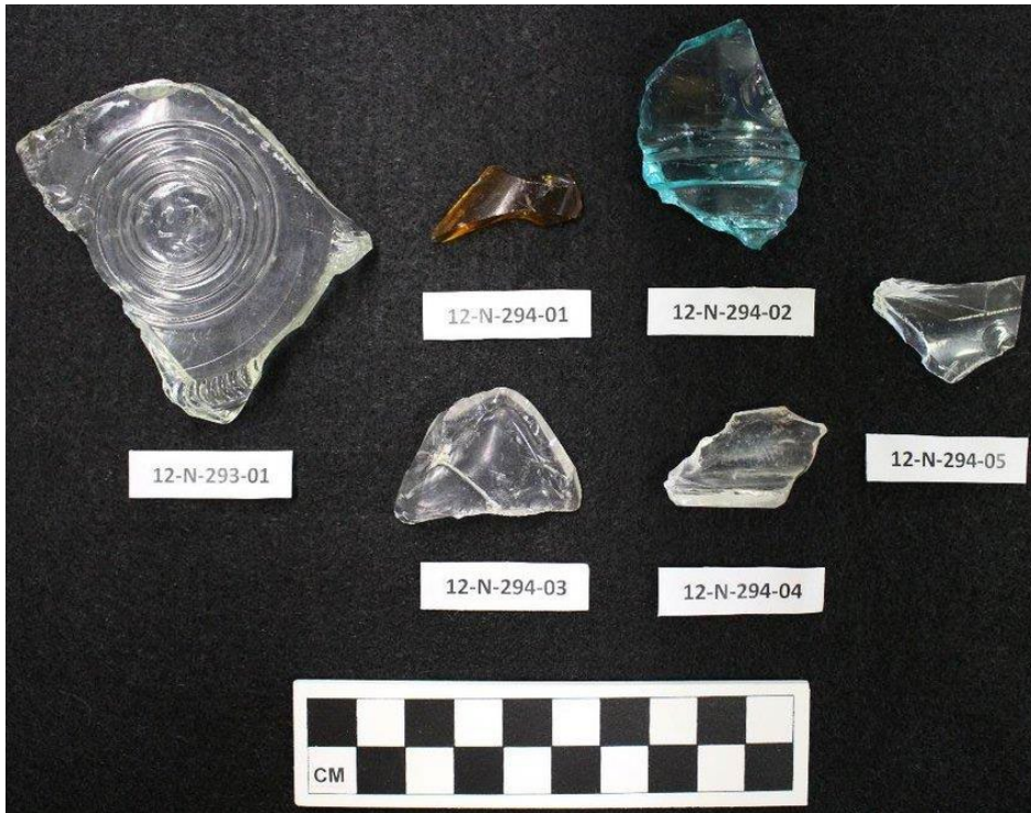
Figure 13. Historical glass