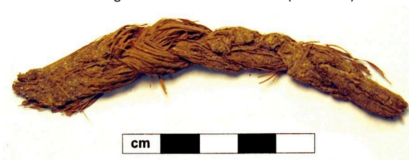
Figure 5. Three-strand braid, sagebrush bark from Paisley Caves (UOMNCH).