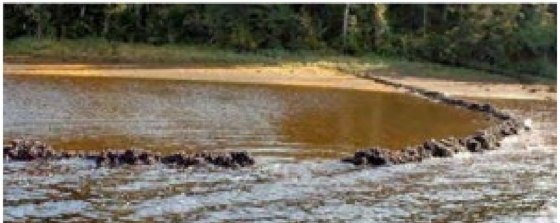
Figure 10. Stone fish weir (Brown and Brown, 2009)