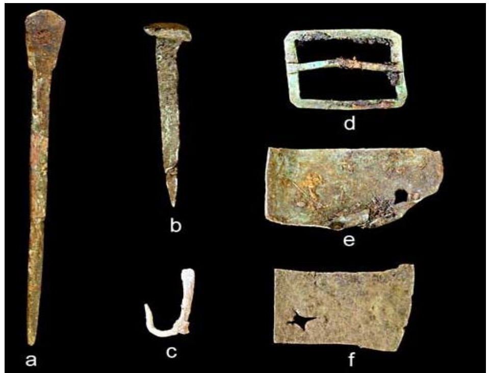
Figure 14. Historical metal artifacts