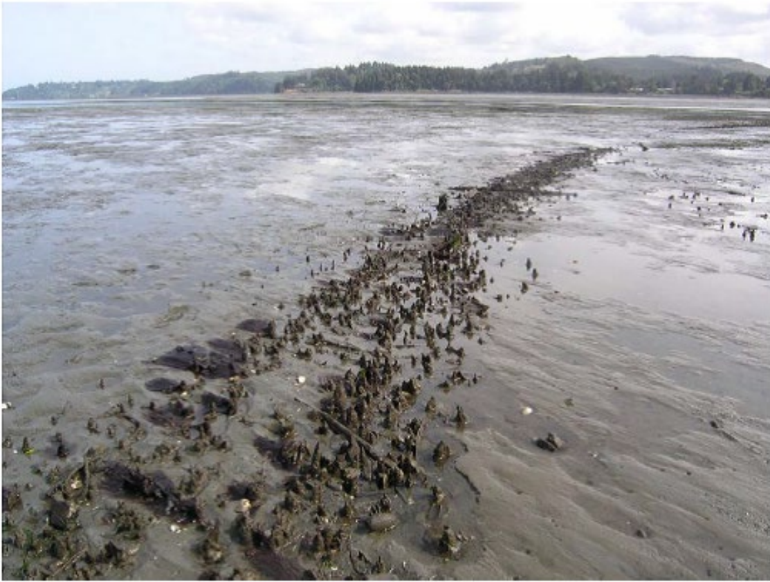
Figure 9. Wooden fish weir (Scott Byram, 2010)