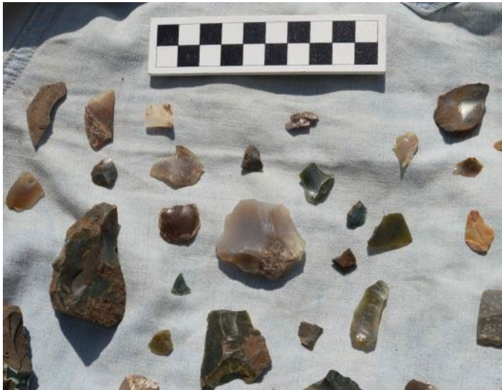
Figure 1. Stone flakes