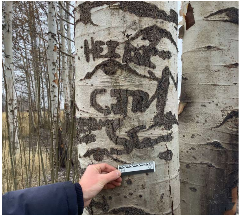
Figure 12. Arborglyph on aspen tree