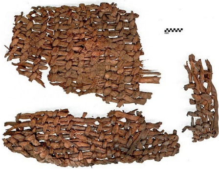
Figure 4. Open diagonal twine basket fragments from Fort Rock Cave (UOMNCH).