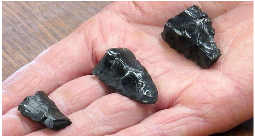
Figure 2. Stone projectile points