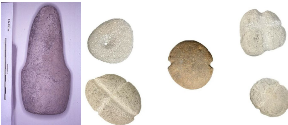
Figure 3. Ground stone tools: (left) pestle, (right) net weights,