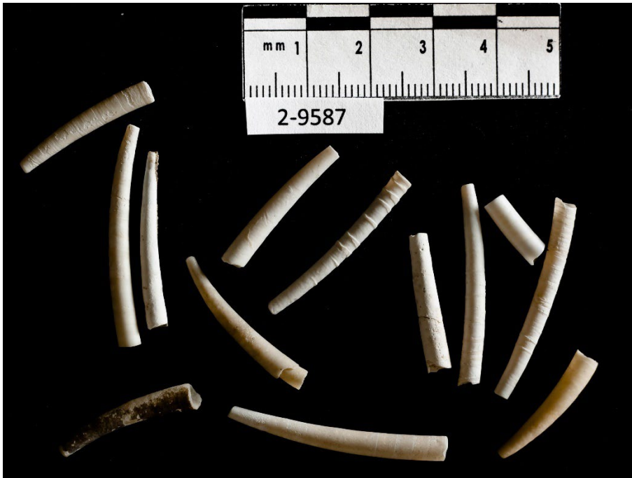
Figure 7. Dentalium shell beads (UOMNCH).