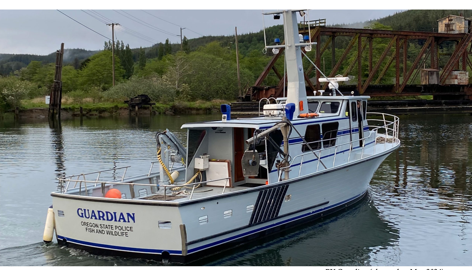
PV Guardian (photo taken May 2024)

Gold Beach and Coos Bay Fish and Wildlife Troopers floated Floras Lake outlet to New River in response to complaints of subjects exceeding bag limits of salmon. The Troopers checked five anglers and no enforcement actions were taken.