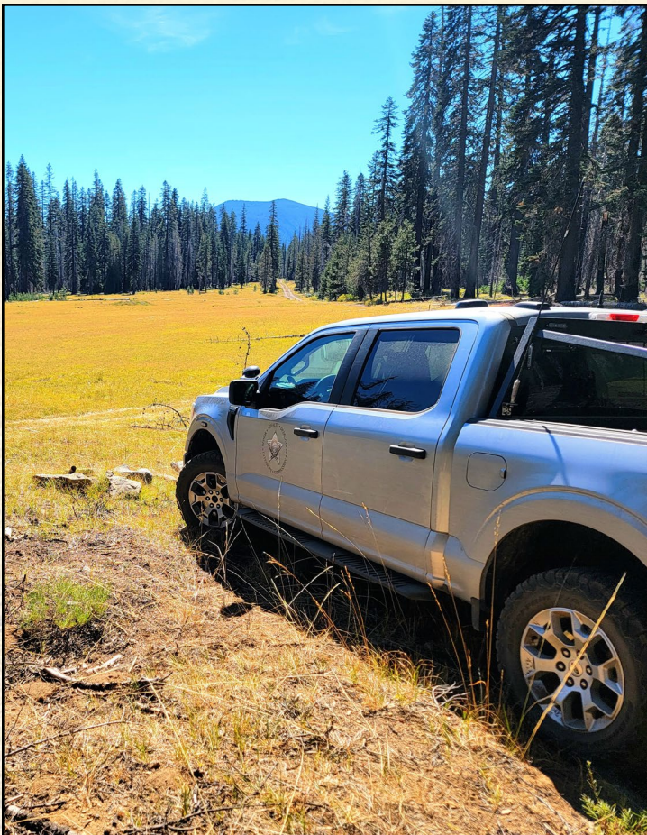
On the cover: A Fish and Wildlife Trooper on patrol on the northeast side of the Sky Lakes Wilderness in Klamath County.