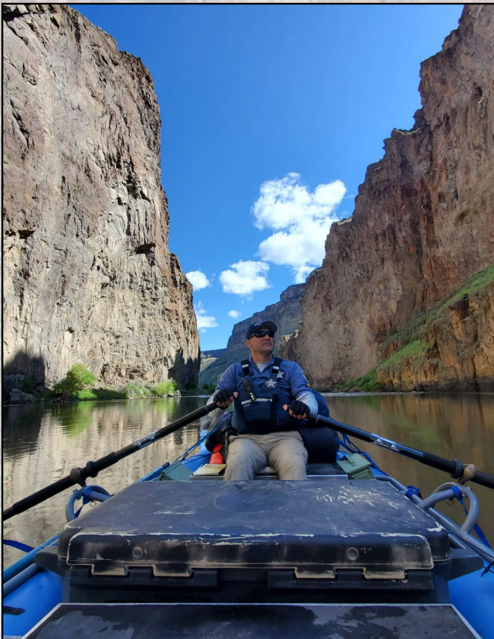
On the cover: A Fish and Wildlife Trooper on boat patrol on the Owyhee River