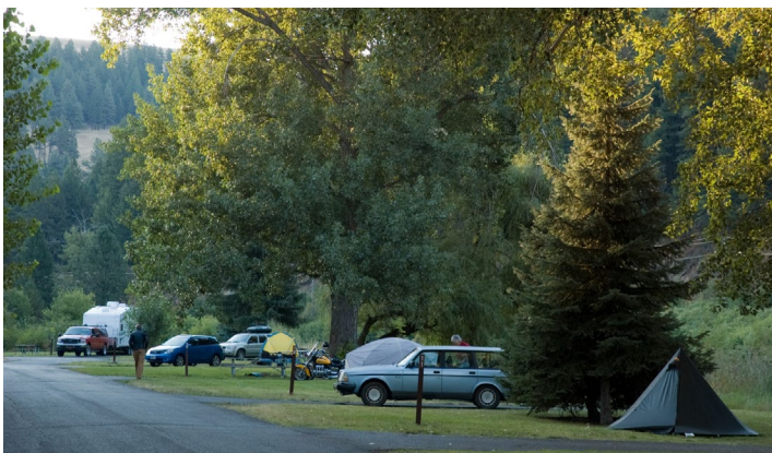
Hilgard Junction State Park campground