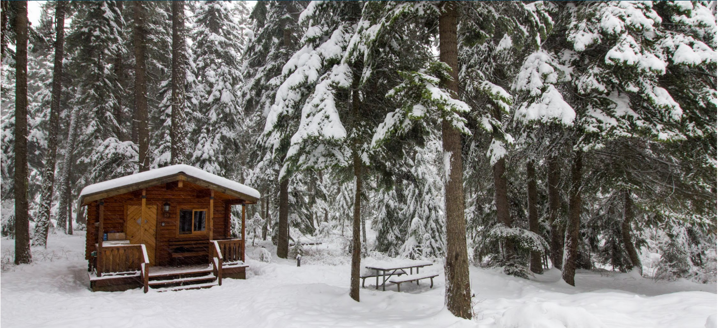
Snowy cabin at Emigrant Springs State Park