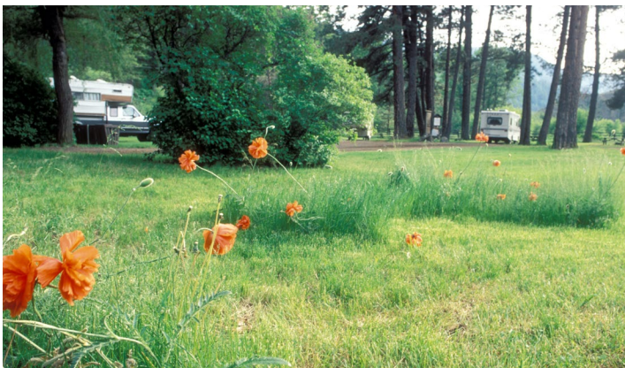
Catherine Creek State Park campground

Near the summit of the Blue Mountains, Emigrant Springs State Heritage Area preserves a site where people, including travelers on the Oregon Trail, have replenished water supplies since time immemorial. Now visitors find a refreshing place to camp in a mature forest halfway between Pendleton and La Grande on Interstate 84. On site is a replica Oregon Trail wagon, plus a wide variety of accommodations that includes full-hookups, rustic tent sites, log cabins and even a horse camp. Ten miles of trails are available for hiking and horseback riding.