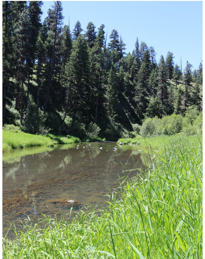
Ukiah-Dale State Park creek view

Blue Mountain State Scenic Corridor with Isculpa Creek Viewpoint