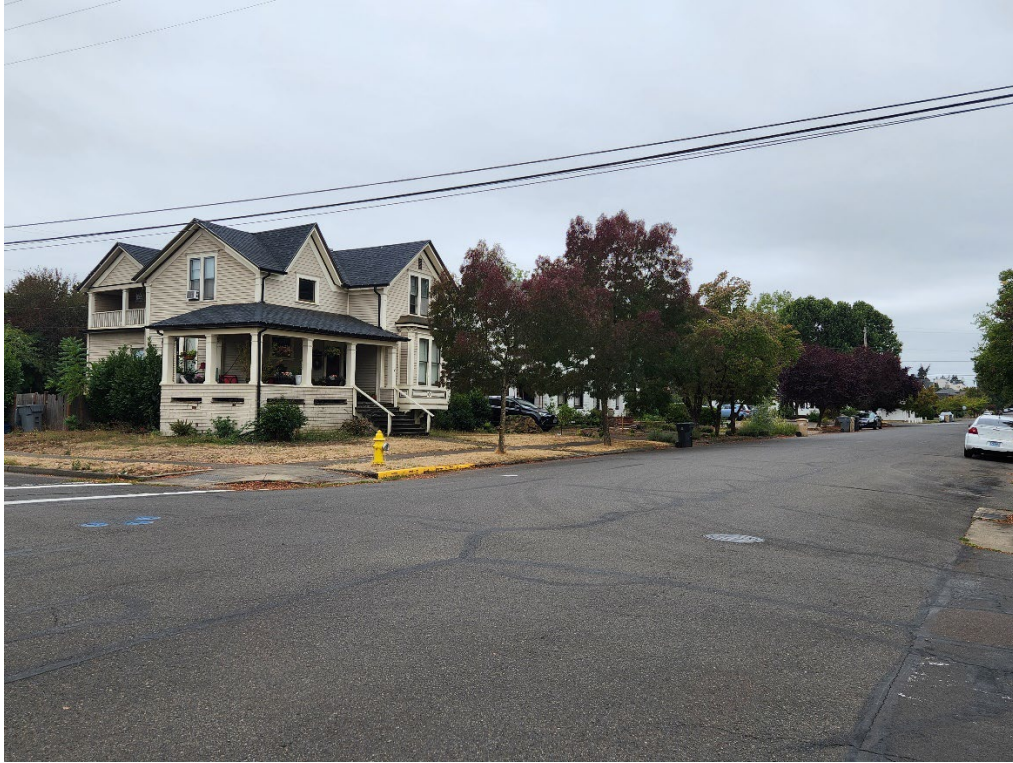
House facing west