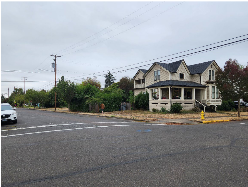
House facing south