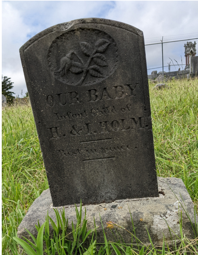
Infant Holm (B31-11): representative gravestone in need of leveling on gravel