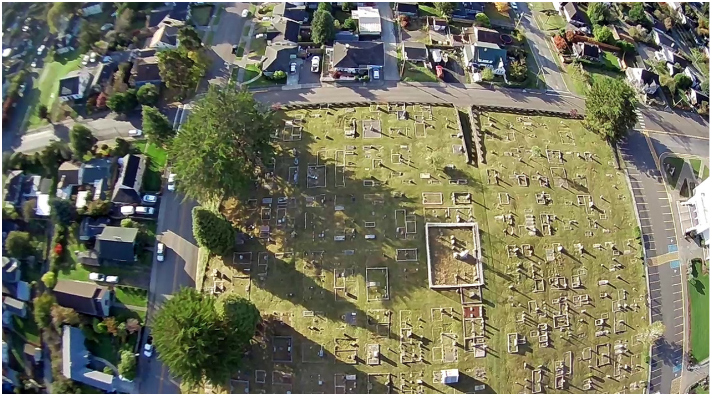
Aerial view of the Marshfield Pioneer Cemetery showing the surrounding neighborhood