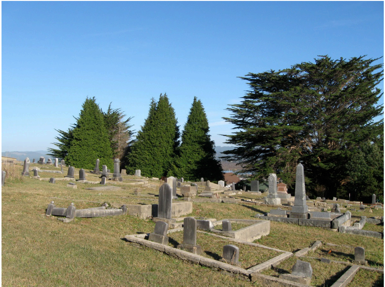
Overview of the Marshfield Pioneer Cemetery looking northwest from center of cemetery