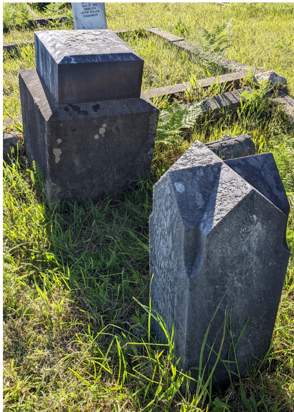
Adams Family (B47-17): representative gravestone in need of leveling and resetting in mortar