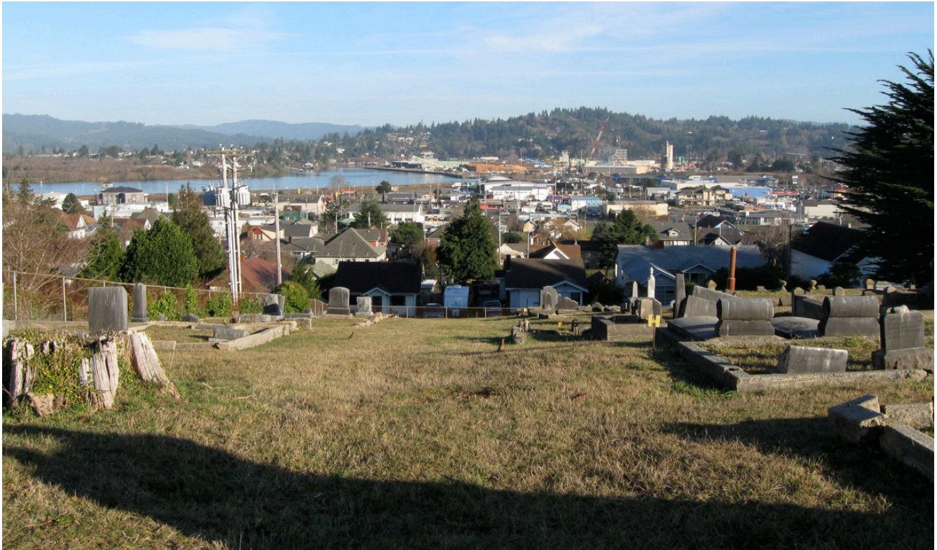
View from the Marshfield Pioneer Cemetery looking towards downtown Coos Bay