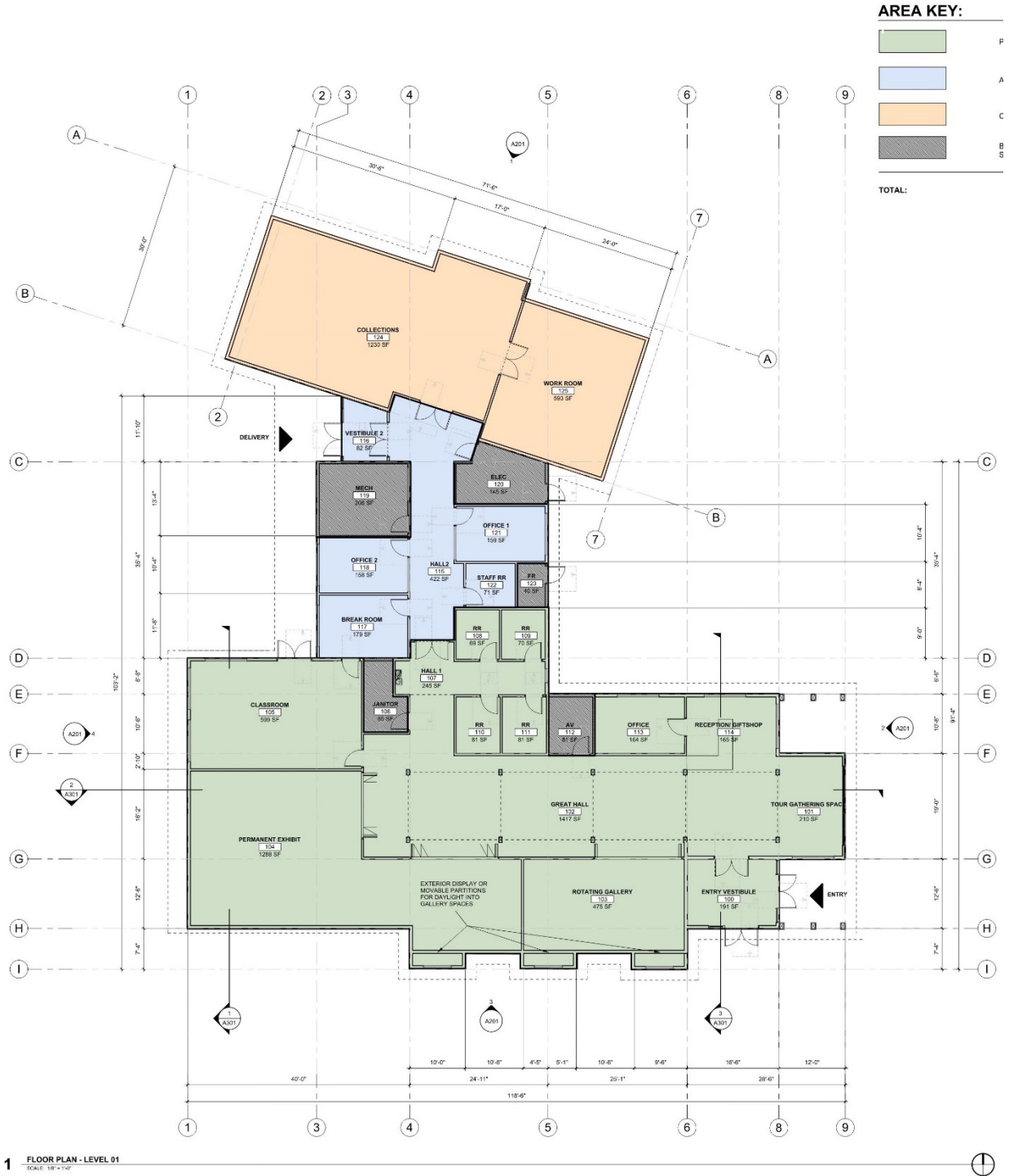
Figure A.2 – Schematic Floor Plan