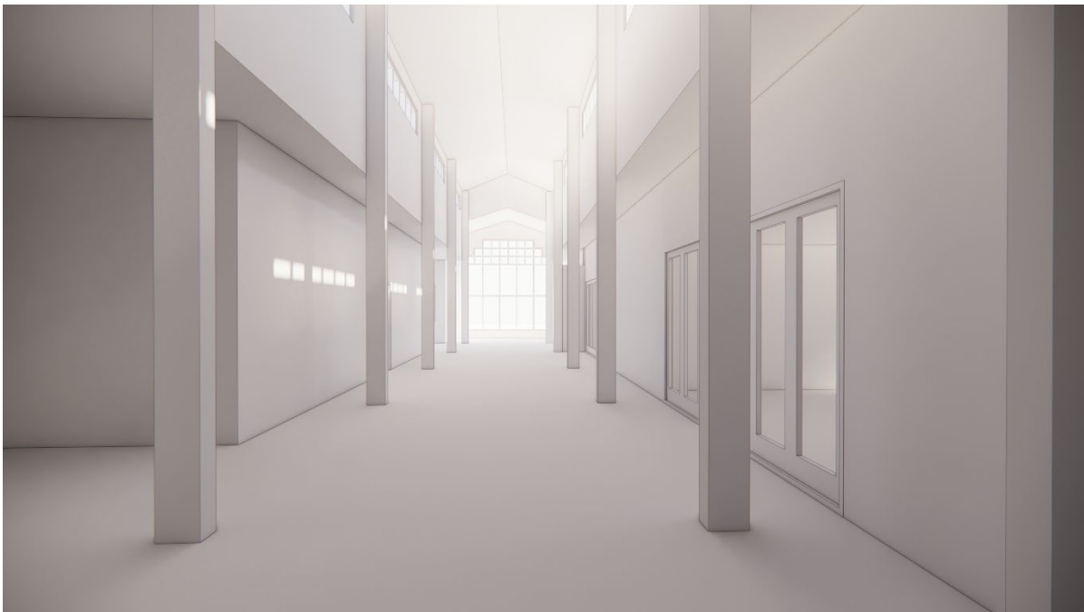
Figure B.2 – Interior main lobby rendering