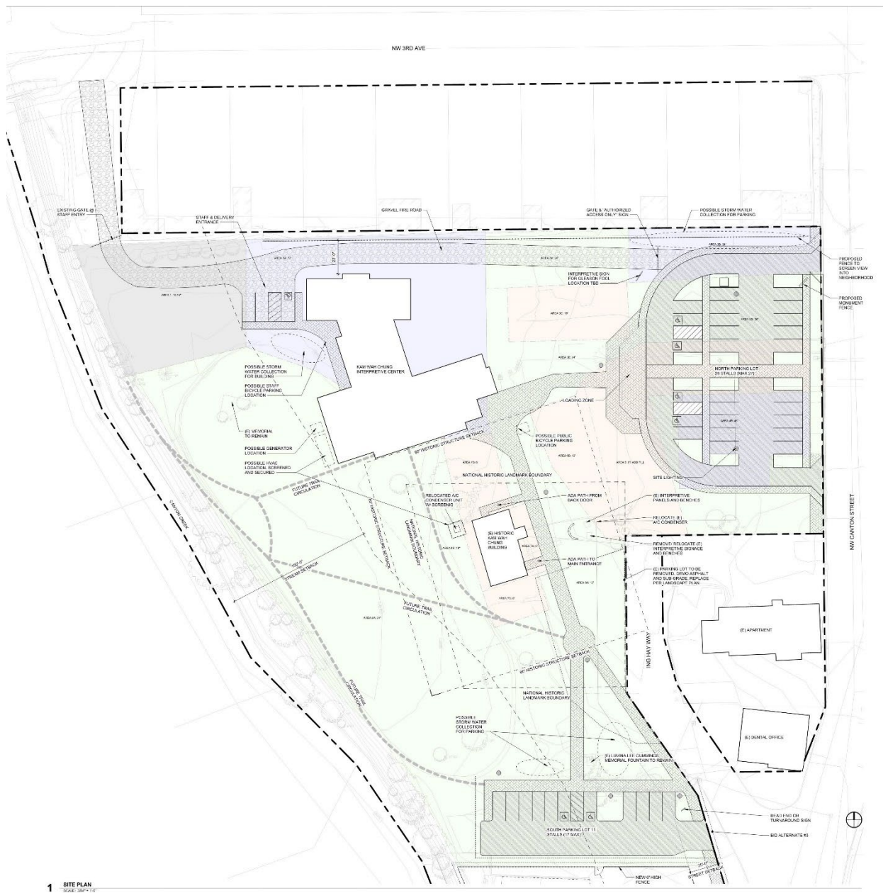
Figure A.1 – Site Plan