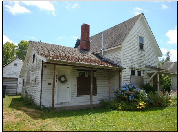
Hannah and Elizabeth Gorman House, Corvallis

Oregon Heritage is documenting the lesser-known history of the state as part of a multiyear effort. Recent entries to the National Register of Historic Places include the Black Historic Resources in Oregon, 1788-2002 Multiple Property Submission and an updated designation for the Hannah and Eliza Gorman House in Corvallis. This project, funded by the National Park Service and Oregon Cultural Trust, is the result of years of partnership and outreach to Oregon's African American Community.