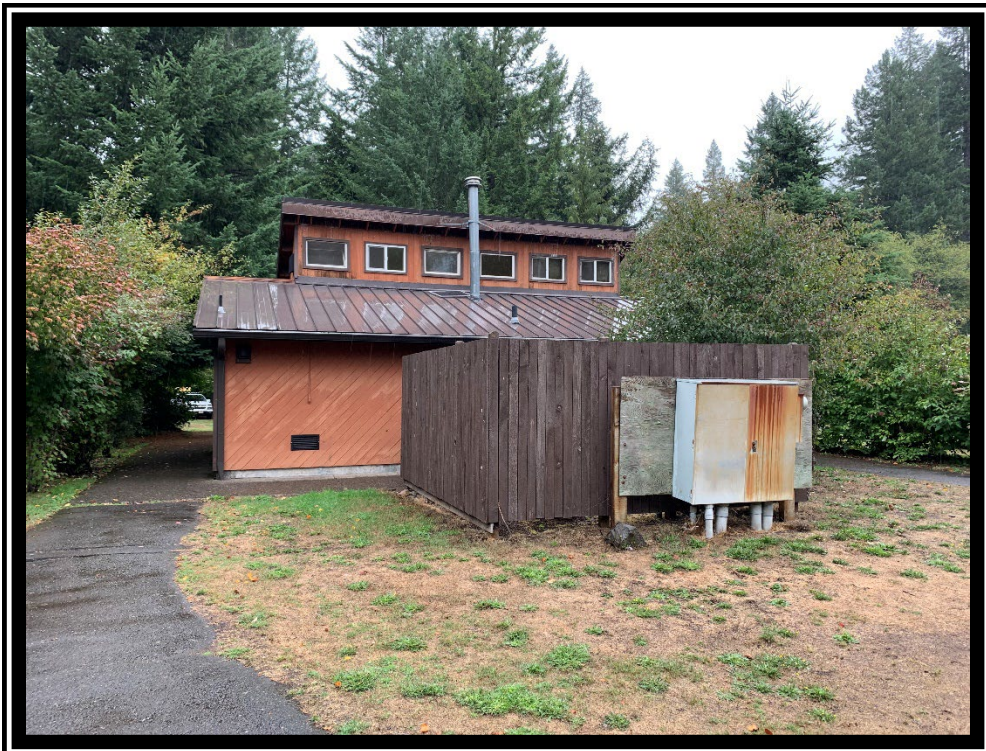
Figure 2 – Existing infrastructure corral adjacent to restroom.