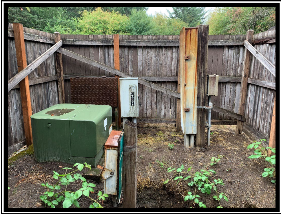
Figure 3 – Electrical and plumbing equipment in need of replacement.