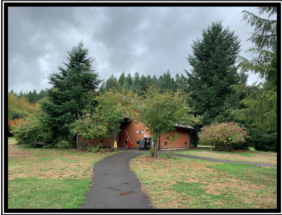
Figure 1 – Existing Restrooms.