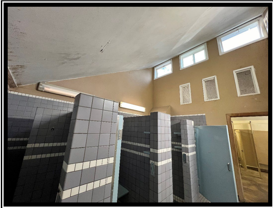
Figure 4 – Aging fixtures and finishes, difficult to maintain and clean.