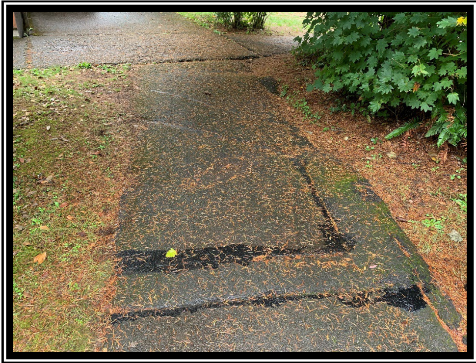
Figure 5 – Patches in paving, non-ADA path