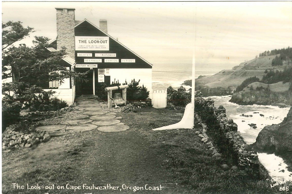
Historic photo taken shortly after the building’s construction in the 1937.