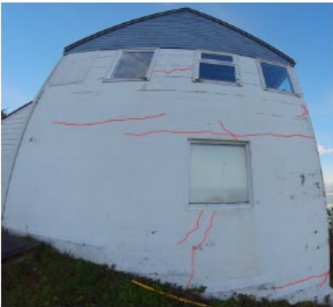
(a) West Elevation

Foundation requires repairs to address deterioration, photos demonstrate exposed rebar and loose aggregate.