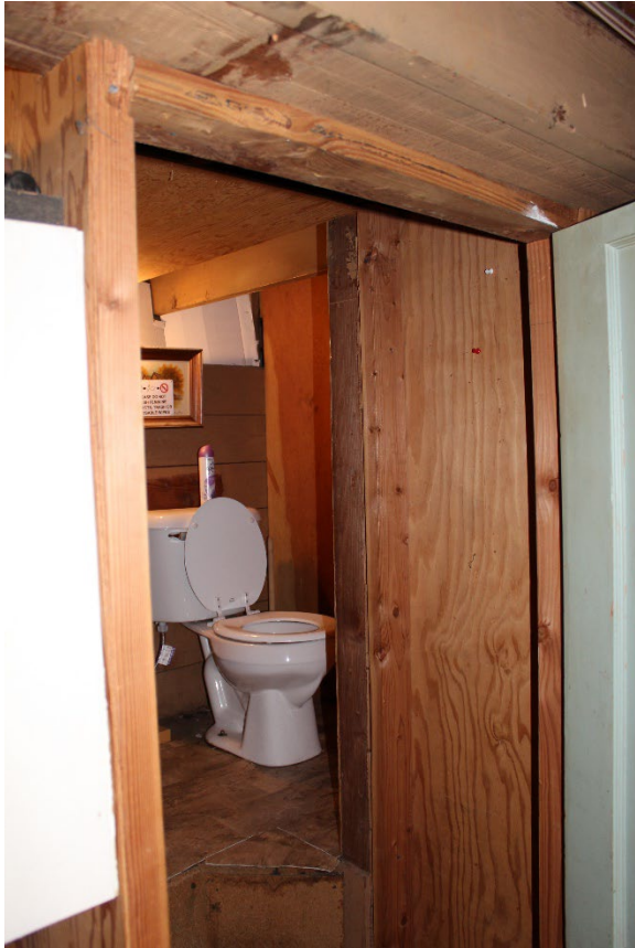
Current restroom conditions.