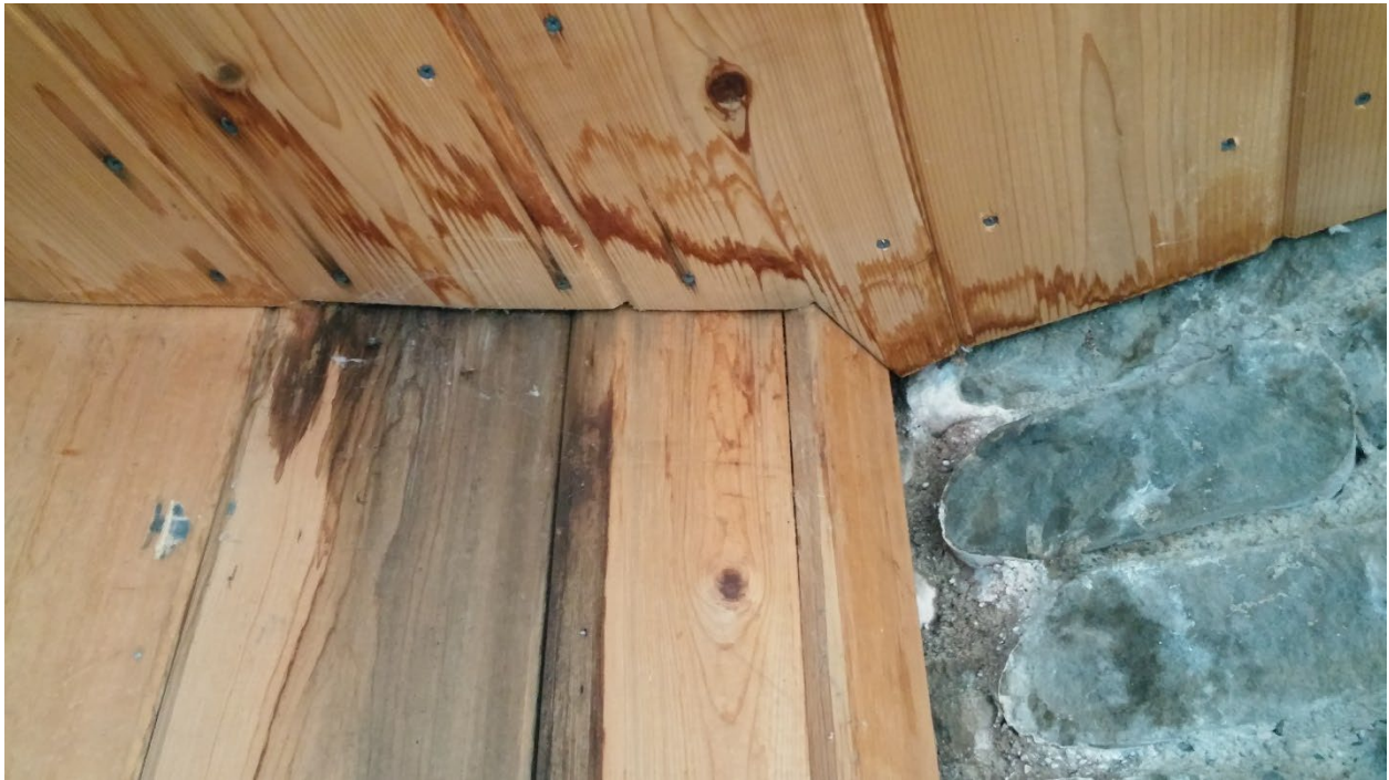
Failing roof and flashing results in deterioration to the buildings historic fabric.