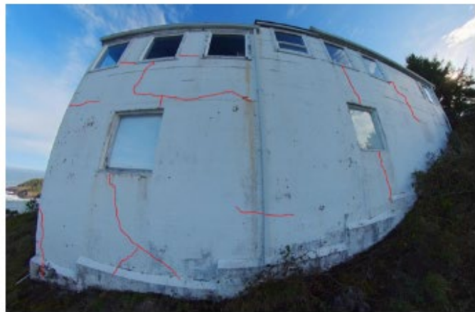
(b) South Elevation

Photos highlight significant cracking to the buildings concrete as assessed by structural engineer consultant. Repairs include addressing concrete stabilization as necessary.