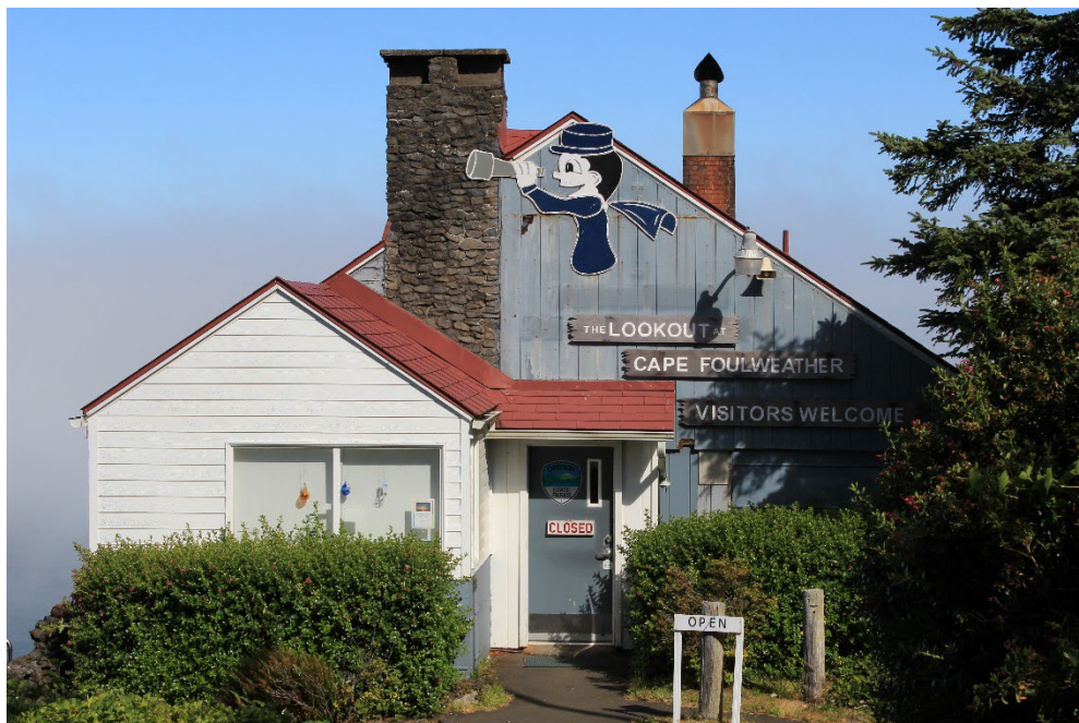
The Look-Out at Cape Foulweather’s primary façade in spring, 2024.