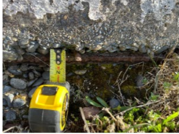
(b) Exposed, corroded foundation reinforcing at south facade

Foundation requires repairs to address deterioration, photos demonstrate exposed rebar and loose aggregate.