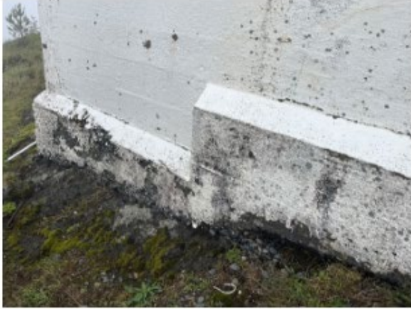
(a) Erosion of concrete at exterior of existing foundations at southwest corner