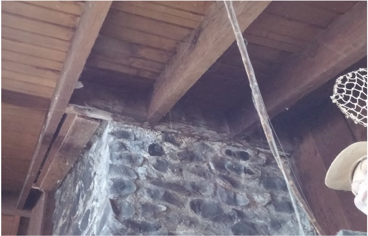
Failing roof and flashing results in deterioration to the buildings historic fabric.