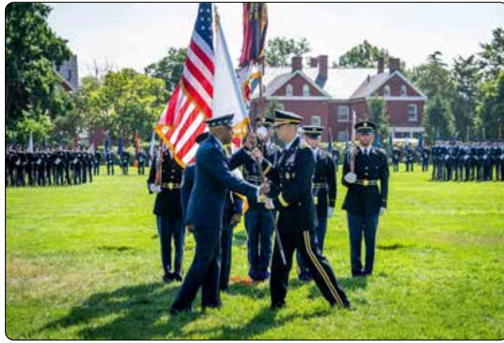
U.S. Air Force Gen. Charles Q. Brown, Jr., chairman of the Joint Chiefs of Staff, officiates the relinquishment of responsibility ceremony of Gen. Daniel Hokanson, chief of the National Guard Bureau, Joint Base Fort Myer-Henderson Hall, Virginia on August 2, 2024.

“General Hokanson’s tenure as the chief of the National Guard Bureau has been marked by exceptional leadership and transformative accomplishments,” Brown said. “His visionary leadership has ensured that the National Guard remains a vital and respected component of our national defense today and well into the future.”