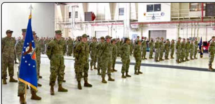
173rd Fighter Wing deploying members stand in formation during the mobilization ceremony on Sept. 7, 2024. Wing members are deploying all throughout the world in various roles as part of their commitment to U.S. national security.

"I want you to know that I am proud of you," said Col. Lee Bouma, 173rd Fighter Wing commander. "It takes a lot of courage to simply raise your hand and join the military. Up until today all of the training you do is theoretical, but deployment is not theoretical. It is the application of America's military might and make no doubt, you are the tip of the 173rd Fighter Wing spear. Be proud of yourselves and your service. You are trained, you are equipped. Leave with that confidence and bear well the name of Kingsley wherever it is your boot shall walk."