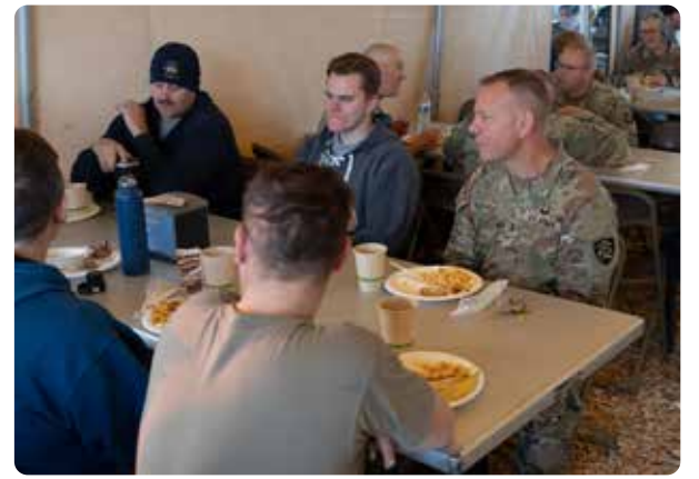
Brig. Gen. Alan Gronewold, and ORNG senior leaders share breakfast with Oregon Guardsmen at the Harney County Fairgrounds fire camp.

The Oregon National Guard also deployed three HH-60 Black Hawk helicopters alongside the CH-47 Chinook. Two Black Hawks are on standby for medical evacuation, while one is available for fire bucket operations.