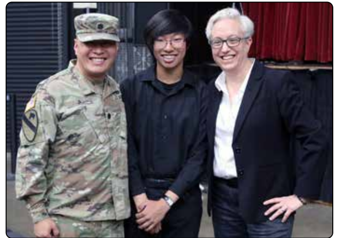
Oregon Governor Tina Kotek pauses for a photo at the Oregon Army National Guard's 41st IBCT mobilization ceremony at the Salem Armory Auditorium in Salem, Oregon on August, 16, 2024.