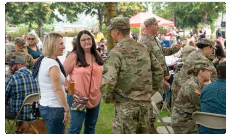
Oregon Army National Guard members assigned to the 2nd Battalion, 218th Field Artillery Regiment attend a deployment send-off event for their families prior to their mobilization ceremony at Pacific University, Forest Grove, Oregon on August 9, 2024.

The 2nd Battalion, 218th Field Artillery Regiment has a long and proven record of answering the State and nation's call to service. The unit was first organized on February 3, 1866 as the Portland Light Artillery. Notable federal service action has comprised with tours in France during World War I, both the Europe and the Pacific theaters during World War II, and numerous missions in the post-9/11 era in the Middle East supporting Operations ENDURING FREEDOM, IRAQI FREEDOM, and SPARTAN SHIELD.