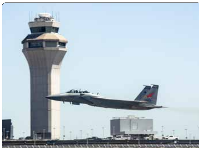
An F-15EX Eagle II, assigned to the 142nd Wing, takes off during the official Unveiling Ceremony for the new fighter jet at the Portland Air National Guard Base, Oregon on July 12, 2024.