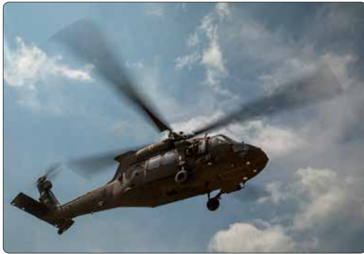
A UH-60 Blackhawk with 1st Battalion, 137th Aviation Regiment, Oregon Army National Guard begins transportation of troops and equipment into the field while at the Joint Readiness Training Center (JRTC) during JRTC rotation 24-09 at Fort Johnson, La., July 20, 2024.

A key aspect of this shift is the move from brigade-centric operations to division-level fights. During the JRTC rotation, the 41st IBCT simulated operating as part of the 40th Infantry Division, practicing the complexities of large-scale combat operations.