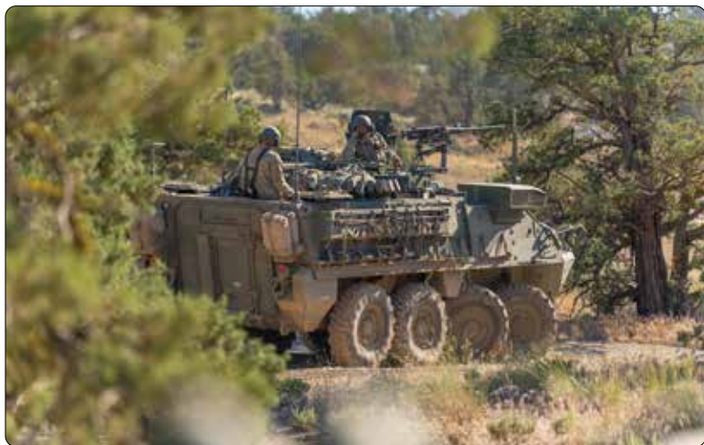
An Alpha Troop M1127 Reconnaissance Vehicle (RV) Stryker crew searches for the opposing force during a movement-to-contact exercise at Biak Training Center in Redmond, Ore., Friday, June 21, 2024.

The successful completion of this training significantly bolsters the unit's combat readiness and provides invaluable experience in tactical smoke deployment, furthering the Guard's ability to serve both state and nation.