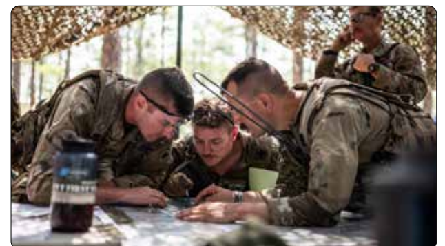
Photo by 1st Sgt. Zachary Holden, 115th Mobile Public Affairs Detachment Oregon Army National Guard Soldier’s with Task Force Guardian led by the 41st IBCT plan the next phase of their operation during the unit’s rotation on July 21, 2024.