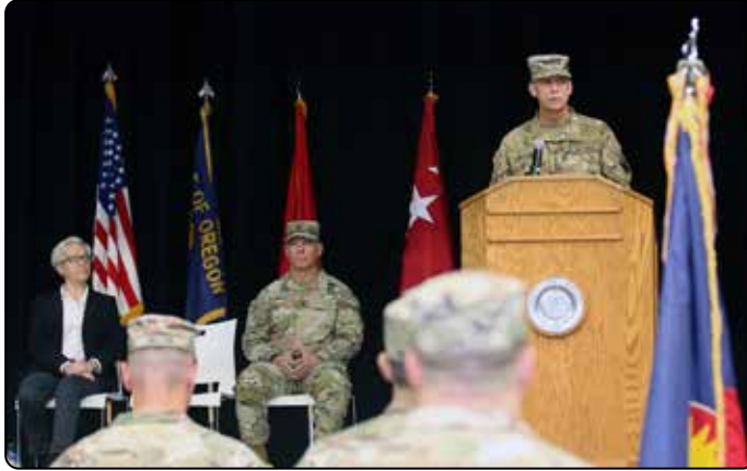
Gen. Daniel Hokanson, the former Chief of the National Guard Bureau, addresses the audience at the Oregon Army National Guard's 41st IBCT mobilization ceremony that took place today at the Salem Armory Auditorium, Oregon, on August 16, 2024.

Oregon Governor Tina Kotek addressed the attendees, emphasizing the importance of their mission.