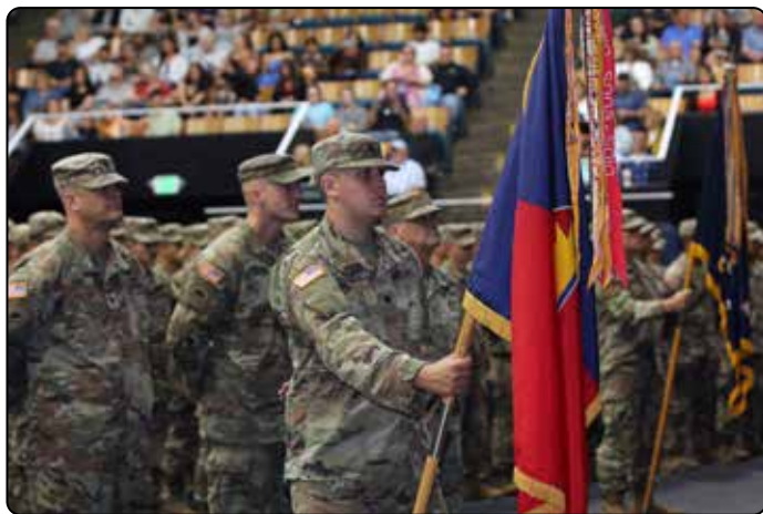
Oregon Army National Guard Soldiers assigned to the 41st Infantry Brigade Combat Team stand in formation during their mobilization ceremony that took place at the Salem Armory Auditorium in Salem, Oregon, on August 16, 2024.

Gen. Daniel Hokanson, Chief of the National Guard Bureau and member of the Joint Chiefs of Staff, also attended the ceremony. As the former 41st IBCT Commander during the Brigade's 2009-10 deployment to Iraq and former Adjutant General of the Oregon National Guard, Hokanson praised the soldiers for their service and highlighted that they are among the less than 1% of Americans who serve in this capacity.