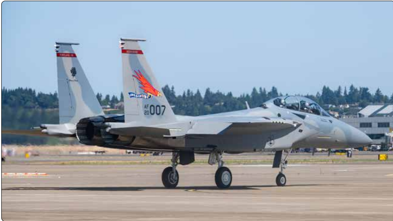
An Oregon F-15EX Eagle II, tail flashing 007 assigned to the 142nd Wing, and the new flagship for the unit, taxis on the flightline before take-off during the official Unveiling Ceremony for the new fighter jet at the Portland Air National Guard Base, Oregon on July 12, 2024. The 142nd Wing will be replacing the F-15 C/D model Eagles with the new F-15 EX II models.