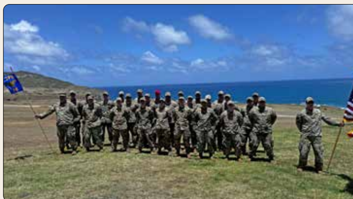
Airmen from the 173rd Security Forces Squadron from Kingsley Field, Oregon gather for a group photo, during their annual training exercise May 4, 2024 at Marine Corps Air Station at Kaneohe Bay in Oahu, Hawaii.