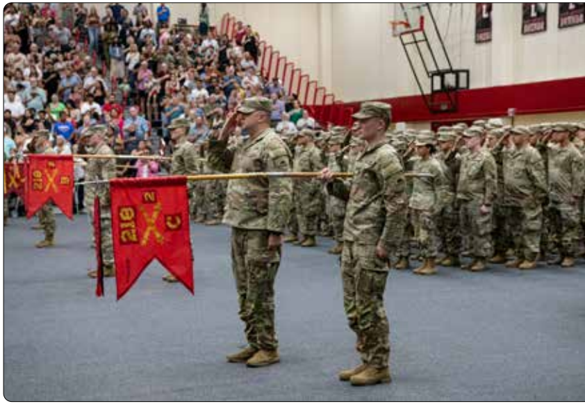
Oregon Army National Soldiers assigned to 2nd Battalion, 218th Field Artillery Regiment render a hand salute during their mobilization ceremony held in their honor at Pacific University in Forest Grove, Oregon on August 9, 2024.