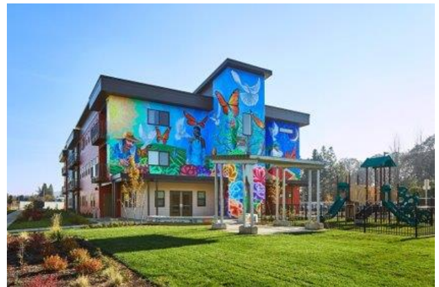
Colonia Paz II, Lebanon, OR