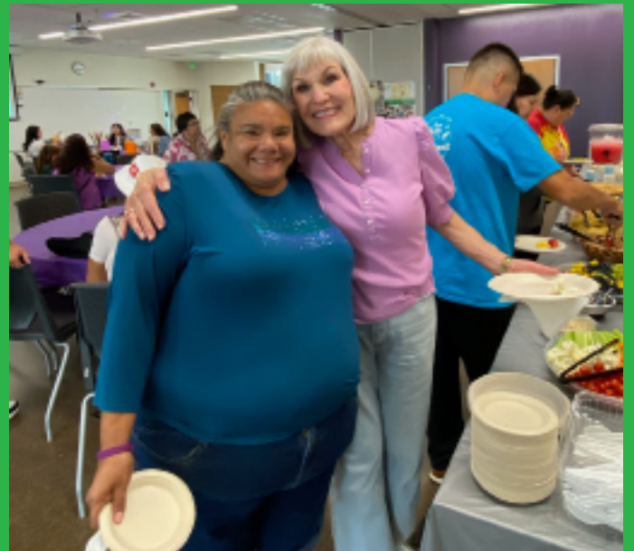
WIC 50th anniversary community events. Clockwise from top right Clackamas County, Linn County, the Confederated Tribes of Umatilla, Jefferson County and Benton County.