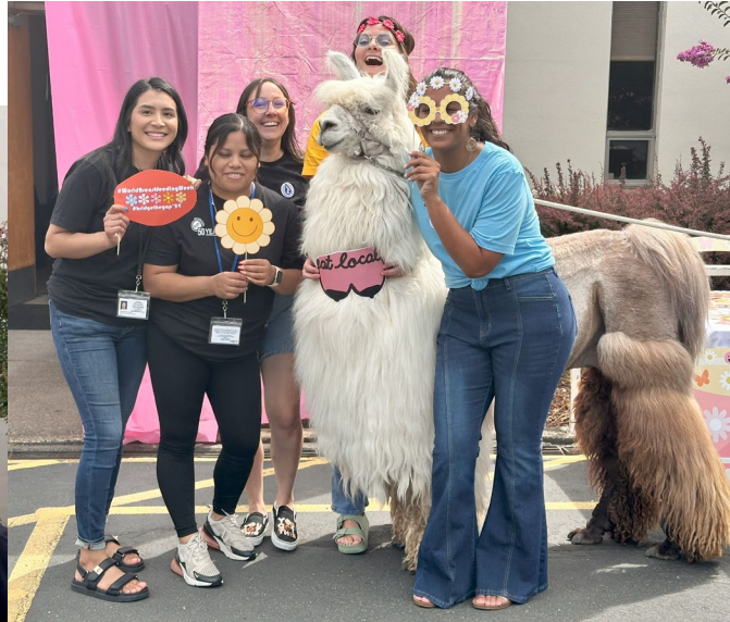
Linn Co. Peer Counselors (and Caesar the Llama)