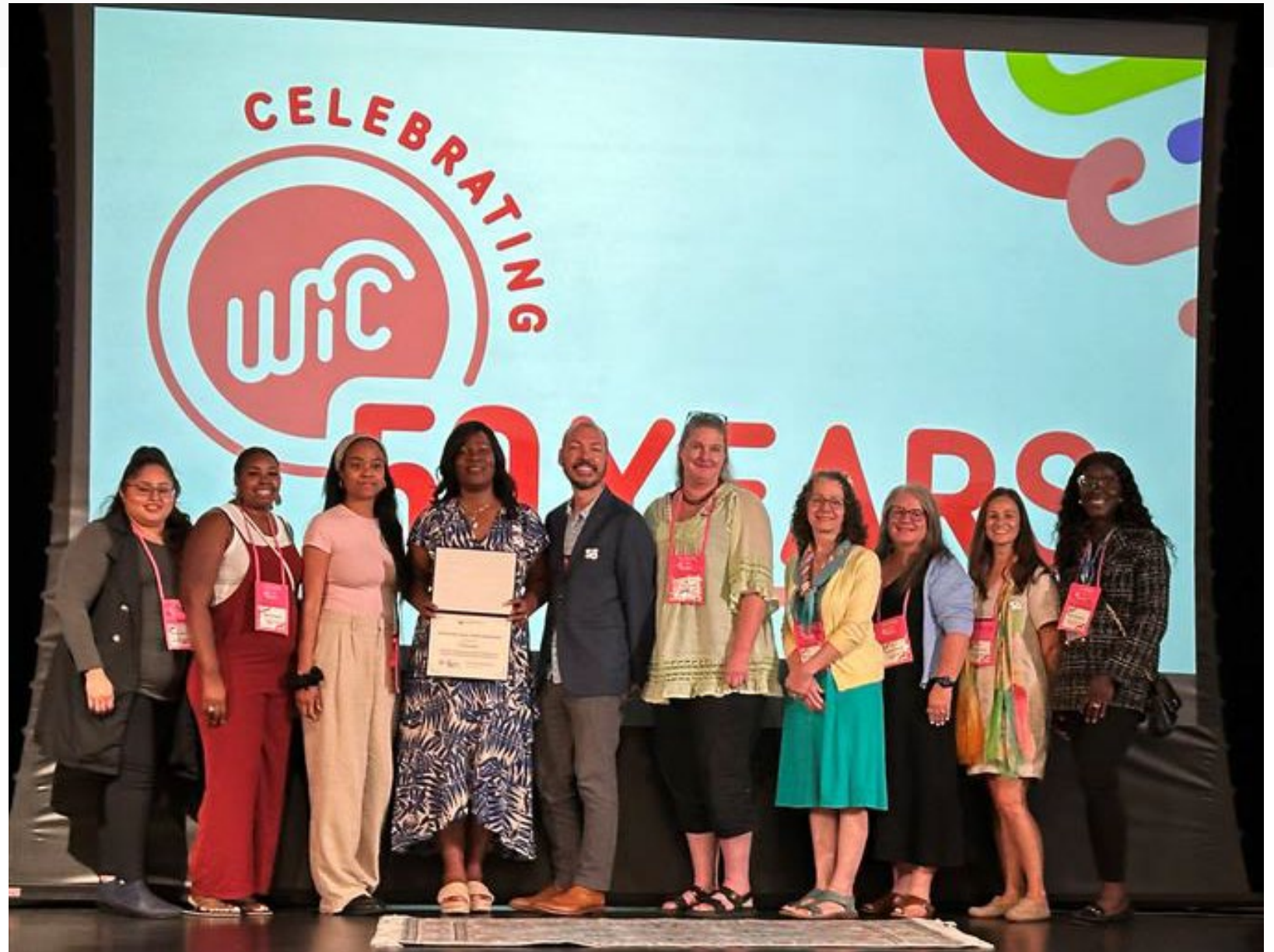
FNS presenting Multnomah County WIC with the Breastfeeding Award of Excellence at the 3rd Annual Breastfeeding Town Hall Forum