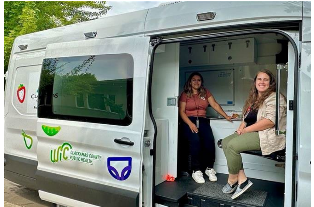
Clackamas County's NEW Mobile WIC Van