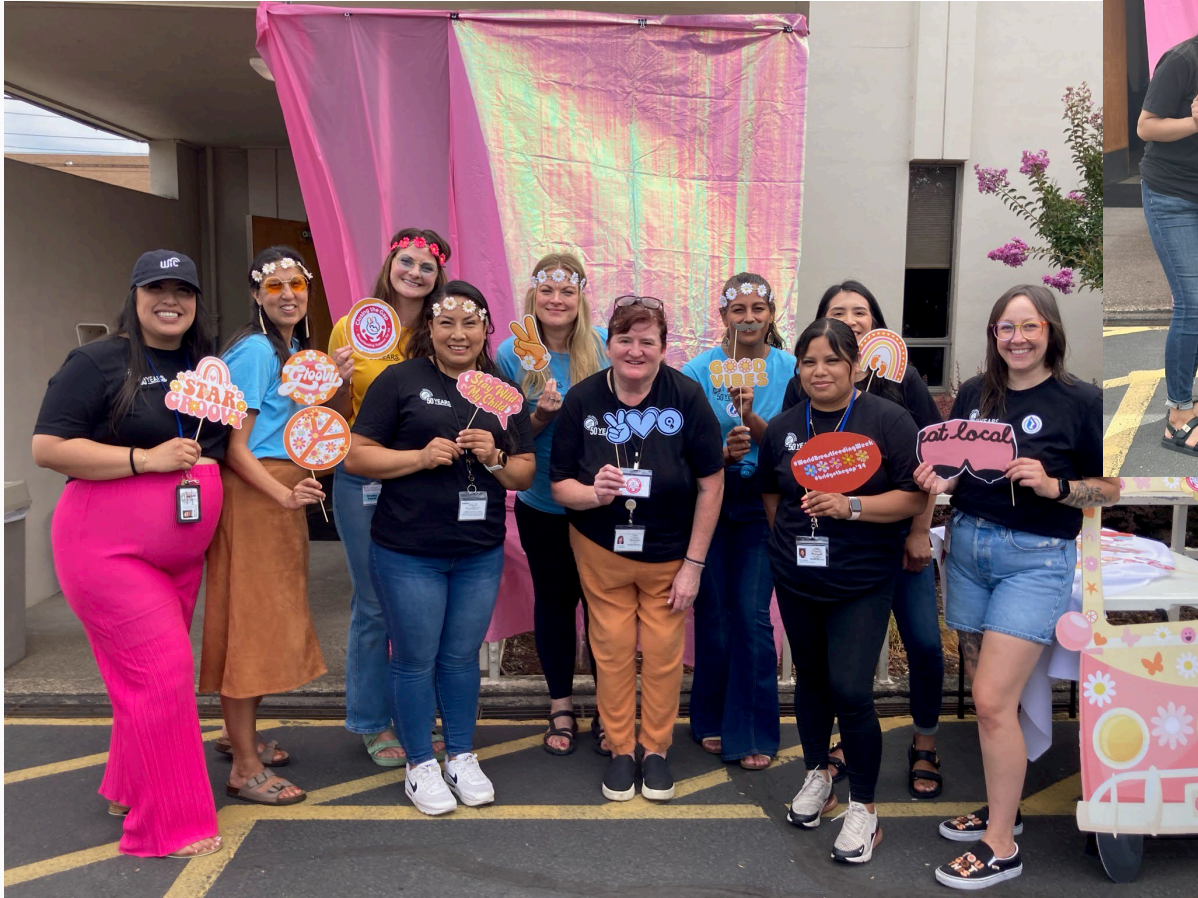
Linn County WIC staff celebrating 50 years of WIC!