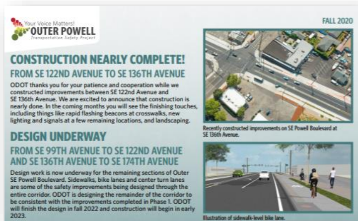
A mailer was distributed throughout the project corridor sharing information about the project.