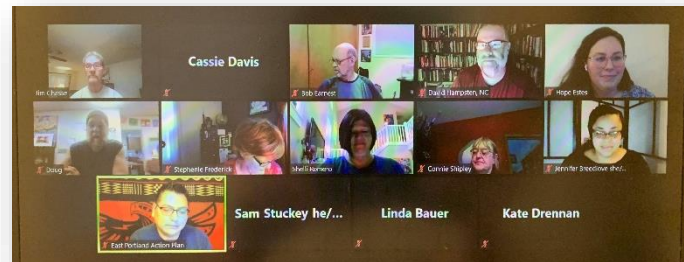
Team members presented project information at East Portland Land Use and Transportation Committee meeting.

A mailed newsletter publicizing the online open house and providing information about the project was sent to all residents within a half-mile radius of the project area (13,901 recipients) and the stakeholder list (284 mailing address recipients). In all, 14,185 community members received the mailer. The mailer was distributed on September 23, 2020.