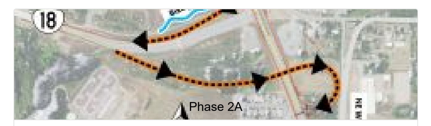
A new interchange at OR 219.