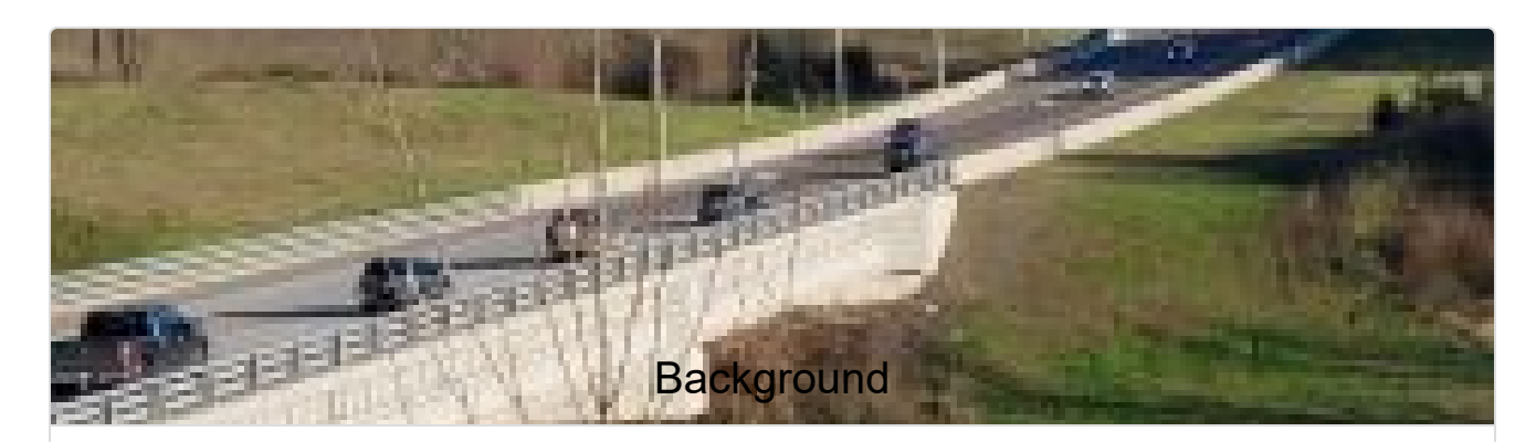
What is the Newberg-Dundee Bypass?