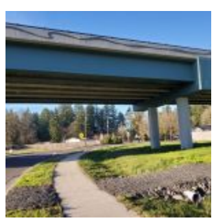
Bridge example 2