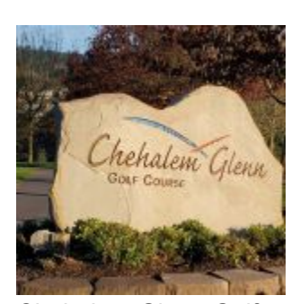
Chehalem Glenn Golf Course