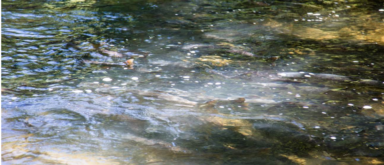
Spring Chinook Near Hebo Oregon