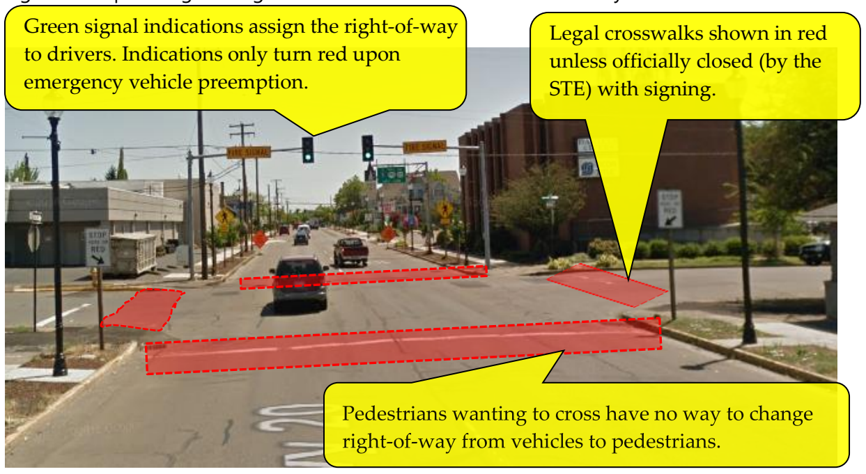
Figure 17-1 | Existing Fire Signal Located at Intersection – Case Study

The five solutions listed below are acceptable in order of preference (note: all of them require STE operational approval):