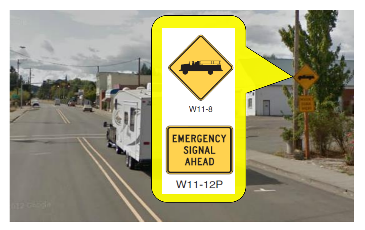
Figure 17-7 | Emergency Vehicle Sign (W11-8) with Emergency Signal Ahead Plaque (W11-12p)

An emergency vehicle sign (W11-8) with an EMERGENCY SIGNAL AHEAD supplemental plaque (W11-12p) is required to be installed in advance of the fire signal. See Figure 17-7. A warning beacon may be used to supplement this advance warning sign if deemed necessary by the operational approval.