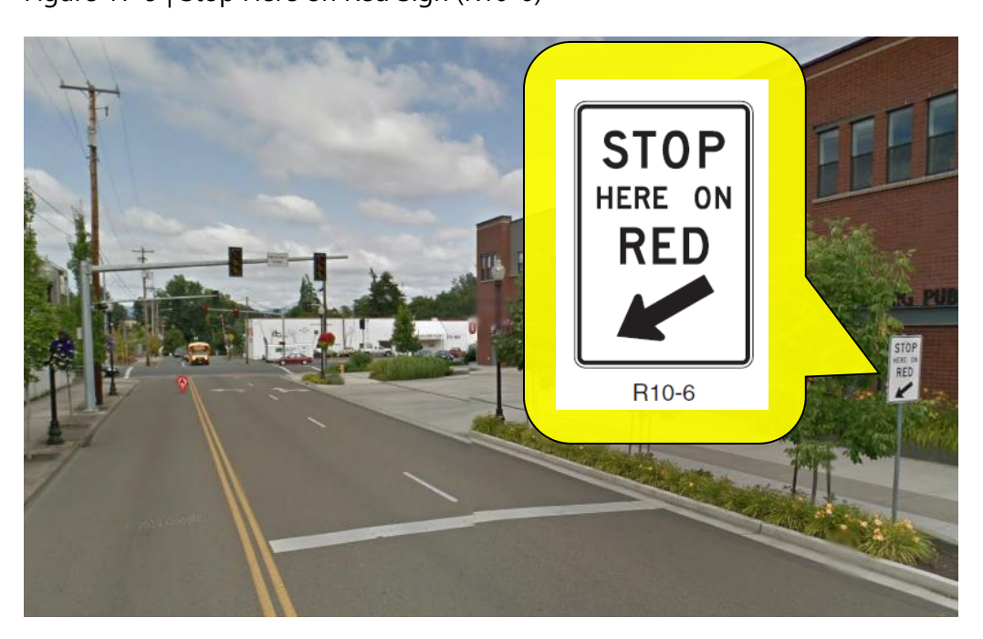
Figure 17-9 | Stop Here on Red Sign (R10-6)

A STOP HERE ON RED sign (R10-6) shall be mounted near the stop line. See Figure 17-9.