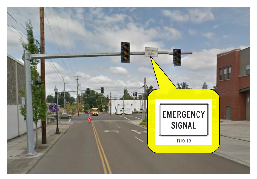
Figure 17-8 | Emergency Signal Sign (R10-13)

A STOP HERE ON RED sign (R10-6) shall be mounted near the stop line. See Figure 17-9.