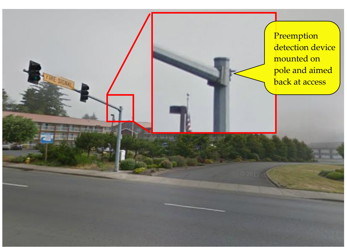
Figure 17-11 | Preemption Detection Device – Placement Example

Preemption detection devices are the most common type of preemption used for new construction. The device should be placed such that emergency vehicle leaving the station will activate it as soon as possible. This will depend on the configuration of the property and the typical path of the emergency vehicle when it uses the access. Multiple devices may be used at different locations to properly hold the preemption input, or a single preemption device may be used in conjunction with a pre-set time if the device would lose the input too soon. Coordinate with the fire department and region signal timer to determine the best preemption operation. See Figure 17-11 for an example of placement.