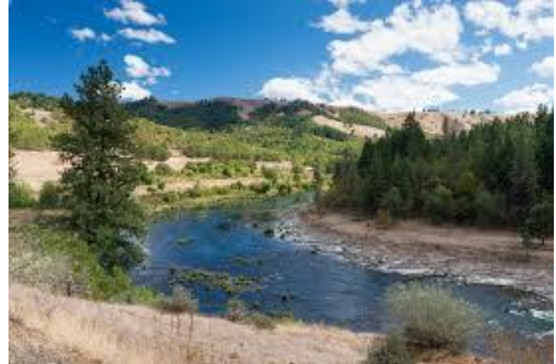
Douglas County