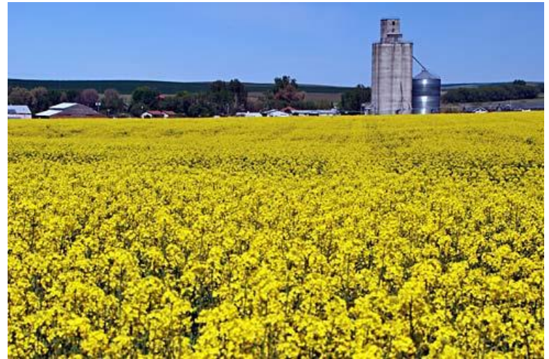
Umatilla County

The APD Tribal Navigator Program is a formal partnership between local APD/AAA local offices and Tribal Entities. The Tribal Entities hire and oversee the Navigator under the job requirements outlined in the Agreement. The Navigator's role is to liaise between their members who are older adults or people with disabilities to assist with enrollment in the appropriate program.