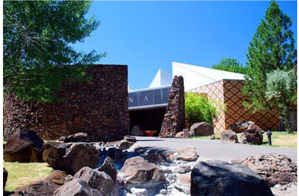
Warm Springs Heritage Museum