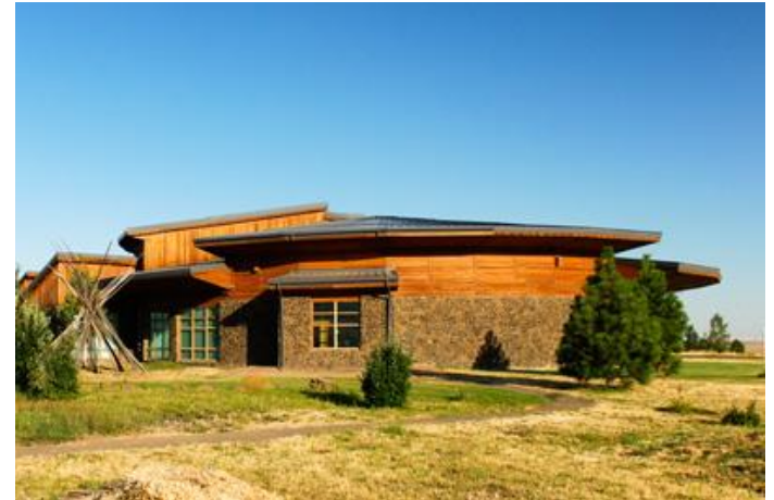
The museum at Tamástslíkt Cultural Institute