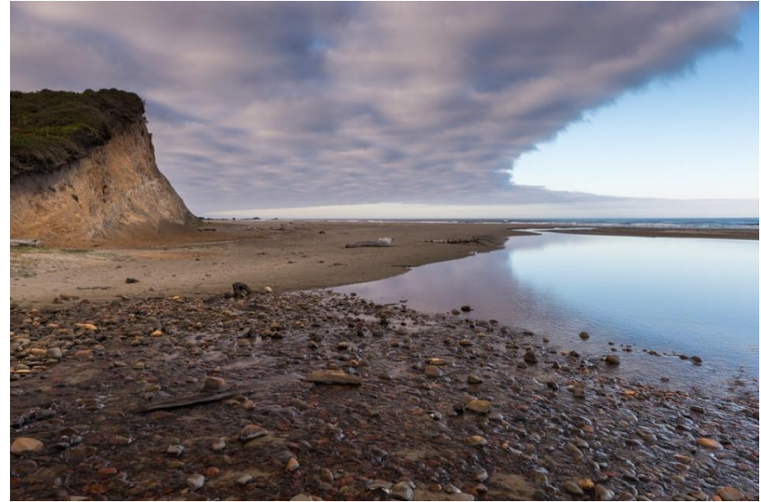
Coos County