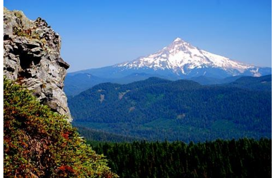
Multnomah County