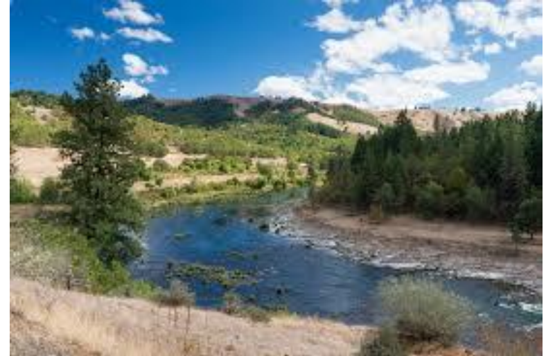
Douglas County