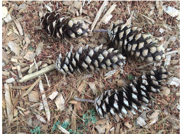
Above: Cones of western white pine are gently curved.

Also highly valued as a timber tree is western white pine ( P. monticola ). It grows from sea level to mid-elevation in the Cascades and Willows. The wood is lightweight, straight grained and takes nails without splitting.