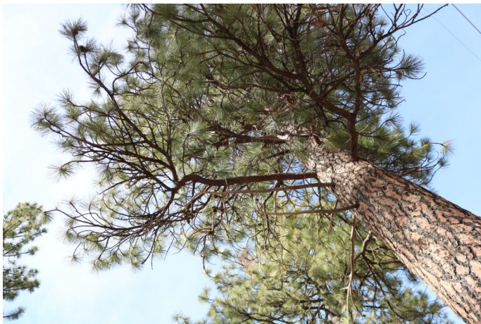
Above: A mighty ponderosa pine growing at Sunriver.

There is a pine adapted to almost every part of the state, from sandy coastal shores to desert sands, and from seasonally wet valley floors to treeline in the Cascades. In cities, native pines are increasingly valued for their drought tolerance, for slowing rainfall runoff, and for reducing noise and air pollution all year long.