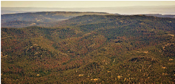
Over 1 million acres with true fir mortality from drought and subsequent bark beetle attack was detected in 2022 aerial surveys.

Drought damage is intensified for tree species that are less drought-tolerant such as western hemlock, true fir, and western redcedar or for any species growing on the fringe of their preferred range. And the preferred range of some less drought-tolerant species appears to be shifting or shrinking due to these changing conditions.