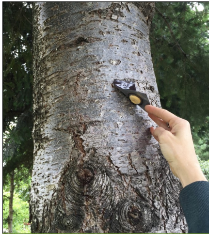
Christine Buhl, ODF

Pheromones help insects find mates, attract individuals to overwhelm tree defenses, or repel individuals to prevent overcrowding. Some of these pheromones have been isolated and replicated for use as repellants or attractants. These products may be applied as pouches stapled to trees, lures attached to traps, by hand or aerial equipment to dispense flakes or pellets over a larger area.