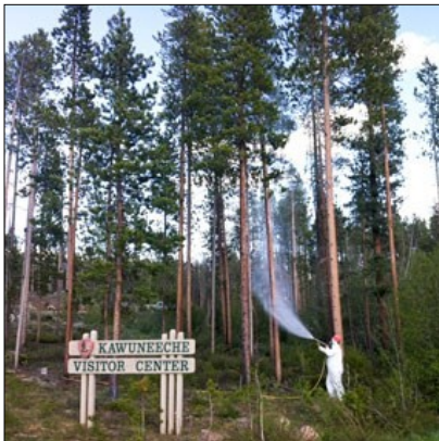
National Park Service