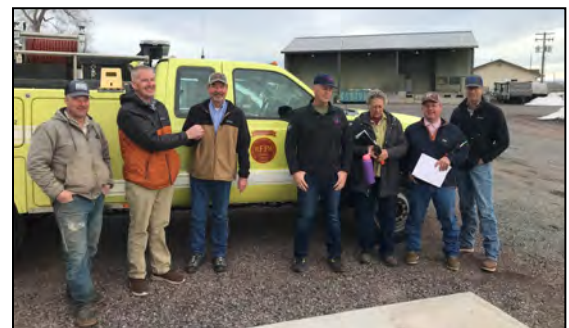
Burns BLM transfers type 6 engine to North Harney RFPA

The best quality equipment we have received has been through the Bureau of Land Management's Rural Readiness Program. In the last four years the program has received four fire engines and one water tender. This equipment is distributed from BLM to the Rangeland Associations in full-service condition before it's reached the end of its life, and comes fully stocked with equipment and ready to respond to fires. This is a big help to associations as well as increasing fire response on state and federal land.