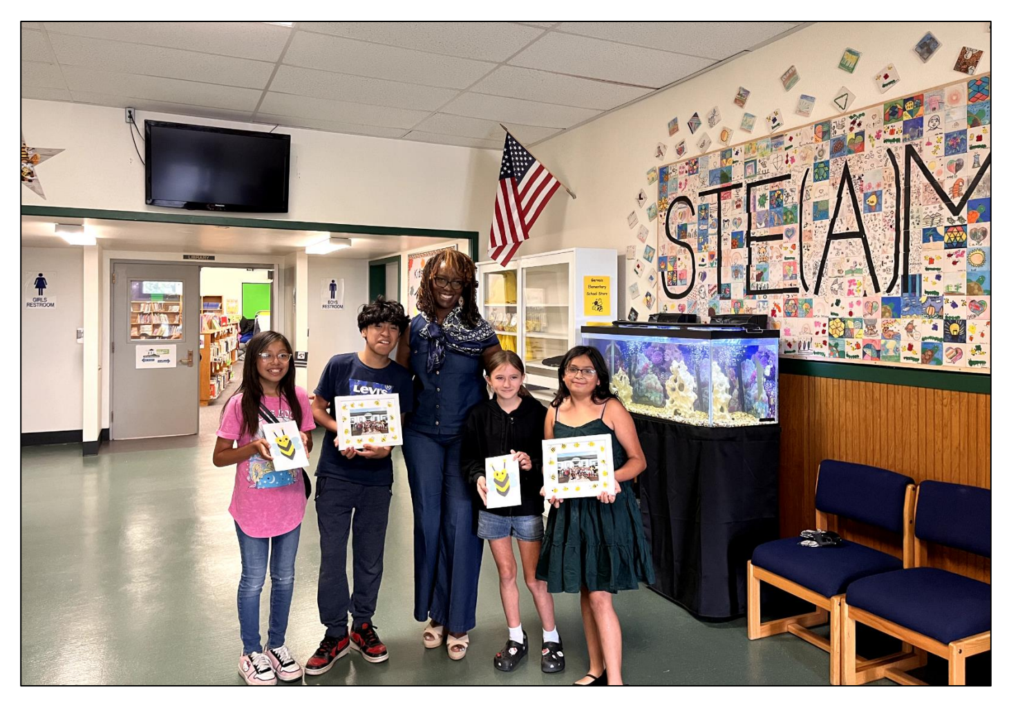
Gervais School District, Summer 2024