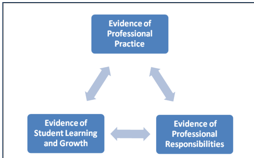
Categories of Evidence for Multiple Measures of Effectiveness

Senate Bill 290 requires district evaluation systems to incorporate student learning and growth as a factor in determining the effectiveness of teachers and administrators. Teachers and administrators, in