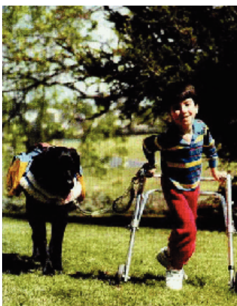
An assistance dog is trained to help

This boy needs both his hands and all his energy just to walk. Luckily, his assistance dog is there to carry his backpack. Assistance dogs are good helpers—helpers—and good friends!