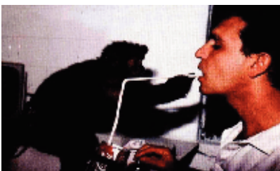
A capuchin monkey helps with many tasks.

. . . . Assistance animals like this capuchin monkey are smart and nimble enough to help in lots of ways—ways—they can turn the lights on and off, play a CD, or get their owners a cool drink!