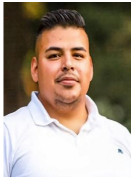
Gustavo Morales 2 nd Congressional District Term expires: June 30, 2026