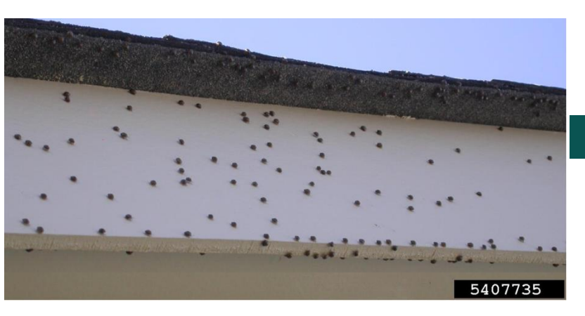
Lablab bug on house.

It is uncertain how far LLB adults may fly. LLB adults are good hitchhikers since they invade structures, which can include vehicles. This allows them to be transported long distances. Their eggs and nymphs can also be moved on plants.