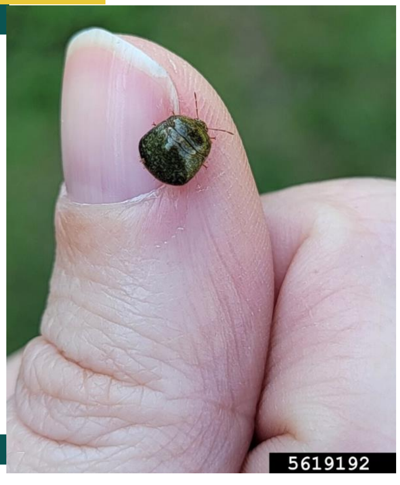
Lablab bug.