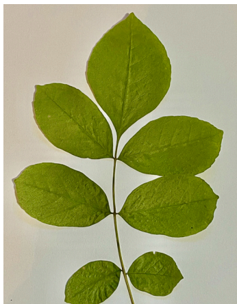
Oregon Ash leaf