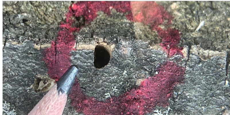
D-shaped emergence hole