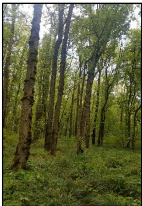
Stand of pure ash is home to elk and other wildlife species. Ankeny National Wildlife Refuge.

Because the threat of EAB has been known for some time, Oregon has led the effort among states on the West Coast to prepare for this destructive pest. With financial assistance from the U.S. Forest Service State and Private Forestry program, ODF is collecting 1 million seeds of Oregon ash from across its range in Oregon. The seeds are being sent to researchers at USDA Genetic Resource Center near Cottage Grove, Oregon, as well as the USDA Seed Lab in Fort Collins, Colorado. Seeds were collected following a protocol that is designed to capture the genetic diversity of Oregon ash in the state. The hope is that one day there will be tree breeding programs to develop Oregon ash that is resistant to EAB and restore affected areas. The seed collection will provide genetic material to start the breeding program.