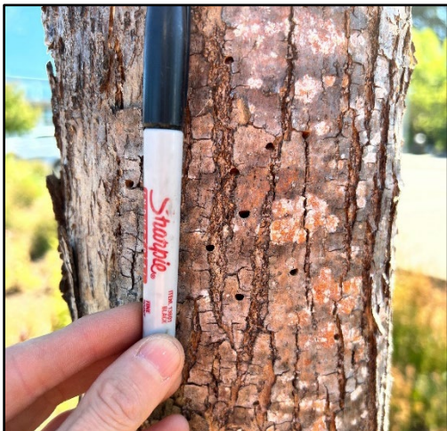
“D-shaped” exit holes from EAB adults. C. Buhl.

feeding on the vascular cambium. Second, the adults in this group of beetles leave a characteristic “D-shape” exit hole about an eighth of an inch wide when exiting the tree. Last, after about three or four years of repeated attack and feeding by EAB, ash trees show significant