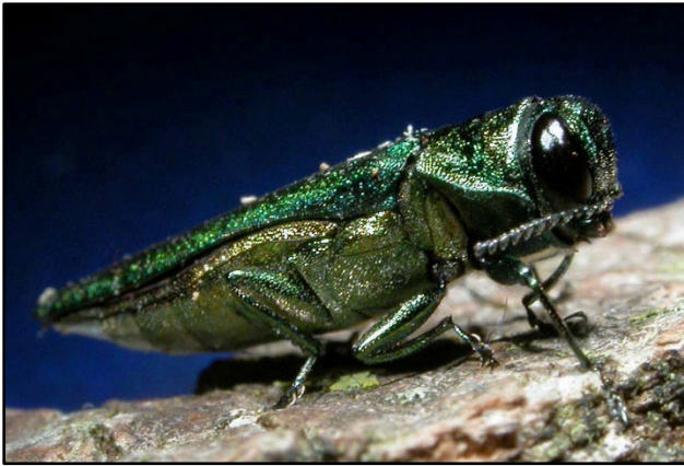
EAB adult. D. Cappaert.