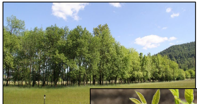
Oregon ash in a small riparian system near Marcola, Oregon. W. Williams.

Oregon ash is known from research trials to be highly susceptible to EAB. Oregon ash is a key part of riparian forests and wetlands west of the Cascades. It grows along streams, rivers and wetlands below 2,000’ elevation, with 80 percent of the species occurring below 1,000’ elevation. At the lowest elevations (below 500’) it forms pockets of pure stands. EAB is