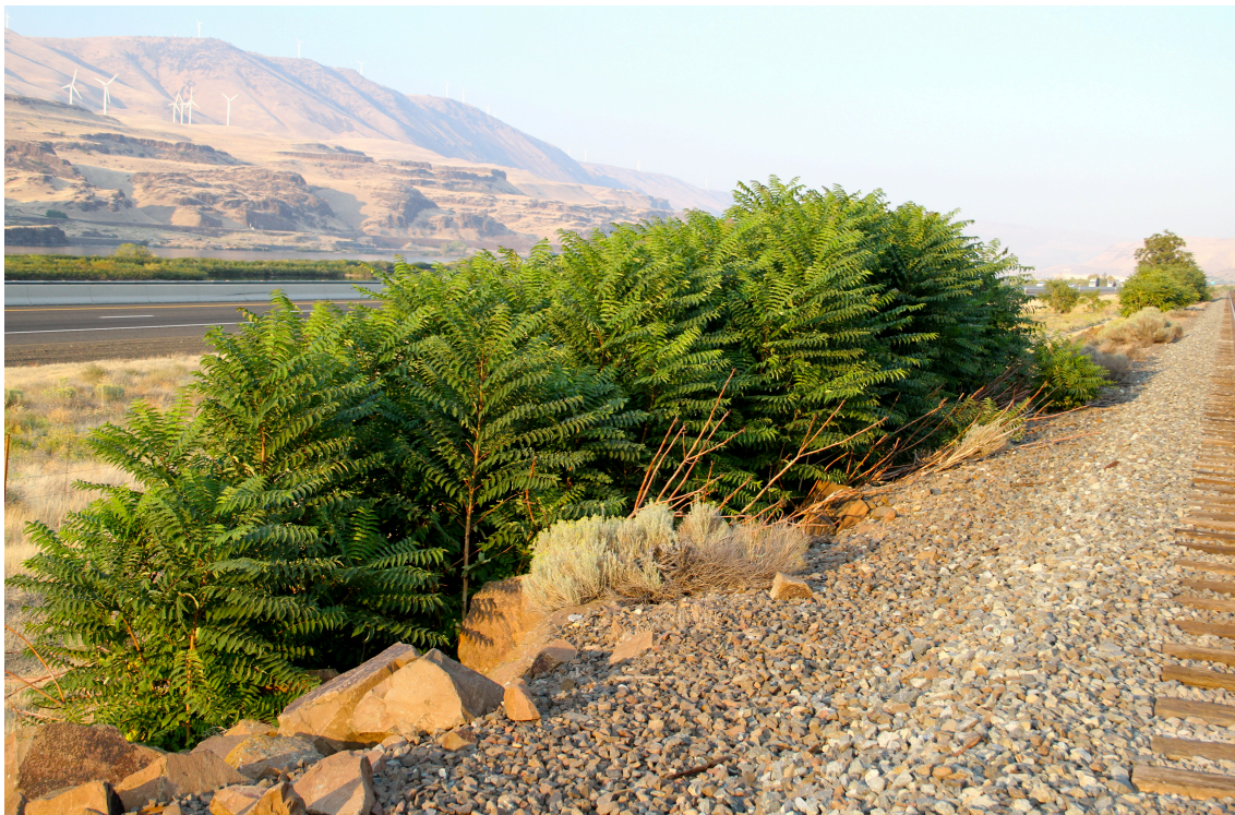
Stands of tree of heaven by the railroad tracks in Rufus, Oregon

Tree of heaven is an aggressive, highly persistent tree species known to infest both urban and rural areas of the East, Midwest and Western states. Originally planted as an ornamental tree as far back as 1784 it became readily available in nurseries by the 1840's. Tree of heaven is a survivor. It thrives in the toughest of city conditions tolerating dry soils, heavy air pollution, dust, and poor soils. It frequently grows through sidewalks, parking lots and streets, pushing up through pavement making control difficult. Away from cities it is commonly found in fencerows, woodland edges and forest openings. In Oregon it is highly naturalized along the Columbia River from Hood River County to Umatilla County growing in low moisture and high wind conditions.