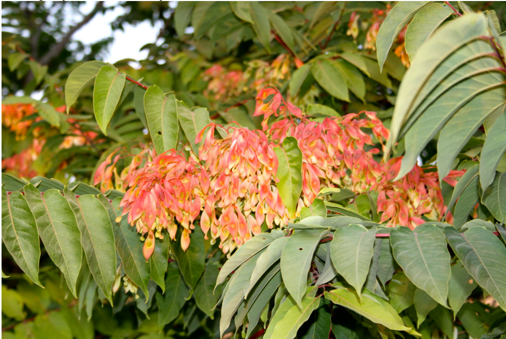
Maturing seed heads, photo by Eric Coombs, ODA

Tree of heaven produces an abundance of winged seeds born on dense clusters. Flowering begins in June with seed maturity occurring in September-October. Seeds will remain on the trees throughout the winter and can be dispersed well away from the parent trees by winter storms. On the east coast, seeds establish rapidly forming a deep taproot and in compacted soils they put forth long lateral roots. Root fragments separated from the mother plant send forth shoots forming new trees. Mechanical disturbance can increase tree densities by chopping roots up into many fragments. In California, despite high seed production, very few seedlings are observed. Most reproduction and spread result from lateral root growth sometimes extending 50 feet from the mother plant. This growth produces clonal thickets of up to an acre. Vertical growth is also rapid with emerged shoots often growing a meter per year for several years.