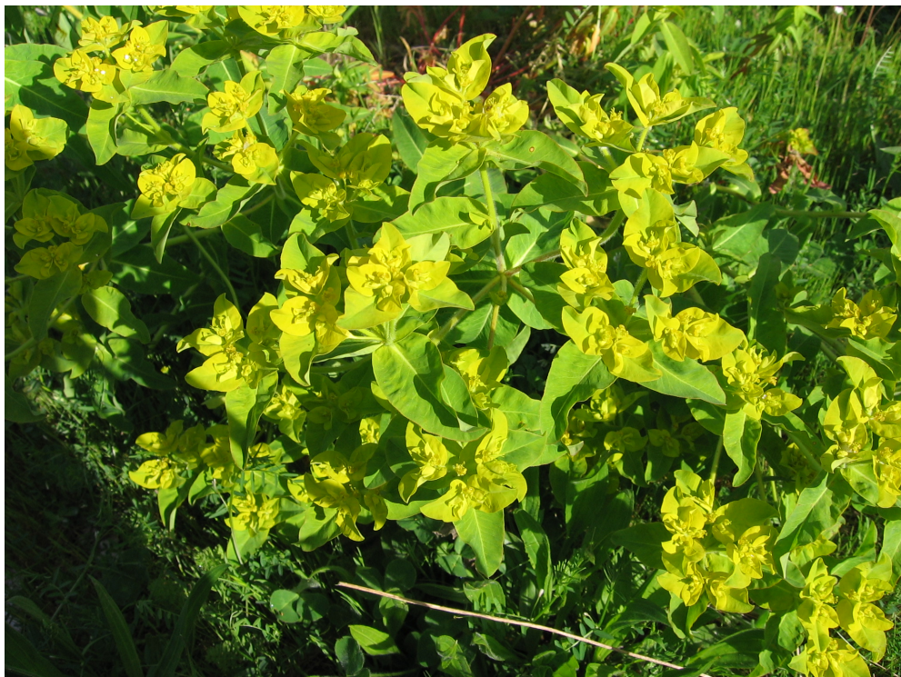
Oblong spurge

Introduction: Oblong spurge is a weedy escaped ornamental species of Euphorbia known from only one site in Salem and one ornamental planting in Eugene, Oregon. Suspected to have been introduced from California in contaminated flax or machinery that was used at the State Penitentiary flax mill in the early part of the 1900’s, it has slowly expanded its territory on the penitentiary property. Growing up to 3’ tall, this species is capable of forming dense stands in more arid climates and could be expected to be a troublesome weed to control should it spread and establish in eastern Oregon. Oblong spurge has a great capacity to infest riparian areas in Washington and Oregon. It is well adapted to a wide range of range, shrub and pine forest environments. In California, it has been found associated with French broom, blackberry and in dry drainages along roadsides.