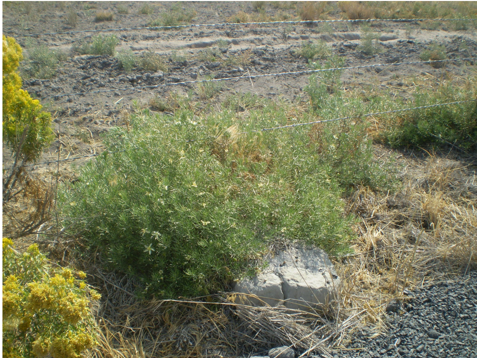
Harney County infestation, photo by Bonnie Rasmussen, ODA

Introduction: African rue is a USDA federally listed noxious weed. A member of the Caltrop family and native to the deserts of Africa and Southern Asia, it has become invasive in parts of the Southwest United States. The seeds yield a red dye (“Turkish red” or “Syrian red”) long used in Persian carpets (Davidson and Wargo). It was introduced and has naturalized in parts of New Mexico, Arizona, Texas, California, and Washington. In Oregon, infestations occur in Crook and Harney Counties (Rasmussen per com 2009). Until 2008, the Crook County site was the only confirmed Oregon infestation.