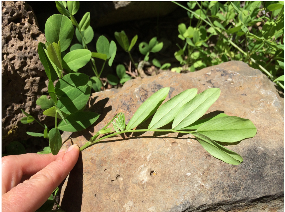
Goatsrue in Portland, Oregon

Reproduction: Goatsrue is a deep-rooted perennial, regrowing each year from a crown and taproot reaching 2 to 6 feet tall by late summer. Plants may have up to 20 hollow stems. The first seedling leaves are large, oval and dark green. The mature leaves are alternate, odd-pinnate with six to ten pairs of leaflets. The white and bluish to purplish pea-like blossoms are borne in terminal or axially racemes. Each blossom produces a straight, narrow, smooth pod, with 1 to 9 seeds per pod. A single plant may produce upwards of 15,000 pods. Goatsrue seeds are bean-shaped, dull yellow in color, and about 2 1/2 times the size of alfalfa seeds. Seeds drop on the ground when mature and may be spread by water, equipment, or animals. Goatsrue seeds typically remain dormant until scarified and may remain viable for ten years.