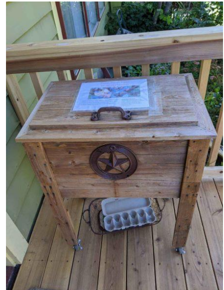
A homemade wooden cooler stores eggs for sale on a front porch.

YES! All eggs must be refrigerated at the point of sale.