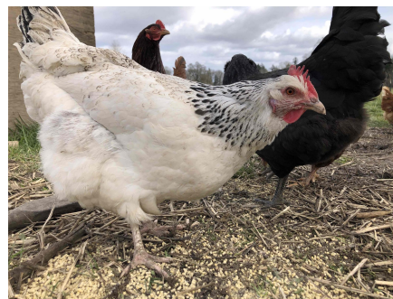
Laying hens on a pasture.