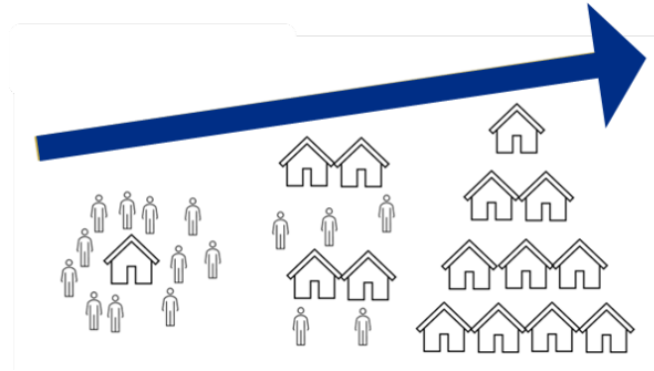
The Governor's goal — stated in Executive Order 23-04 — is to build 36,000 housing units per year for the next ten years.

One-time investments, such as Climate-Friendly and Equitable Communities, are not continued. However, carryover funding in the two new dedicated funds, Community Green Infrastructure and Housing Accountability and Production, is included in the new biennium budget.