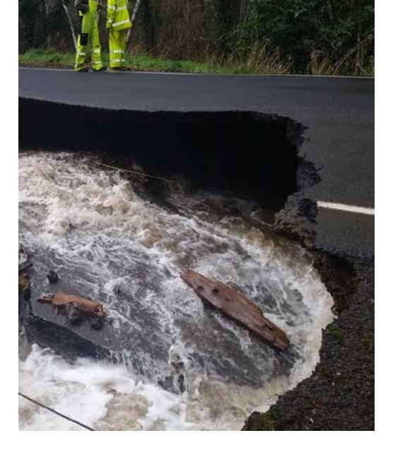
When culverts failed, inundation and debris did significant damage to county roads.