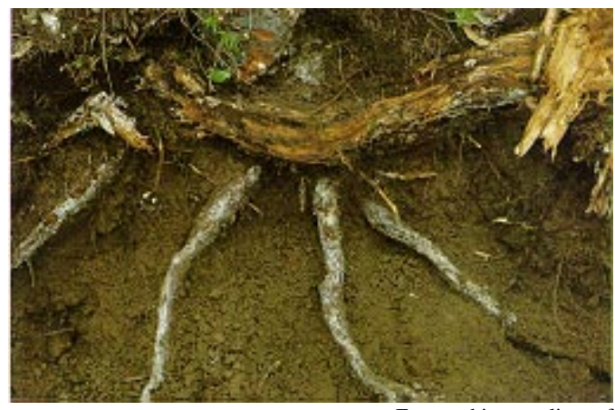
Ectotrophic mycelium of Phellinus weirii