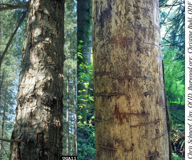
Chris Schnepf, Unv. Of ID, Bugwood.org; Christine Buhl,

An attack site favored by this beetle is the branch collar (junction of a branch and the trunk). These beetles may also attack slash and windthrown trees. Indicators of infestation include orange-tan or white boring dust (frass) in bark crevices or clear pitch streaming down the bark from the point of attack. Trees with more than 10 pitch streams on the main bole have a high probability of dying. Rough and/or bulging patches of bark may