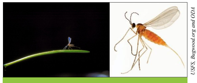
Douglas-fir needle midge adults are 2mm long

These insects occur down from Canada to California and across to Montana.