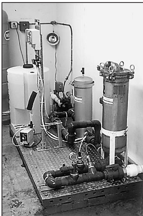
Photo 8-1. Bag filters for Giardia removal, installed in steel housings.

Diatomaceous earth (DE) material consists of fossil skeletons of microscopic diatoms. They are mined and then processed to produce fine, porous, angular media from 5 to 50 microns in size. This type of filtration is widely used for swimming pools, but has also been used successfully to remove turbidity and Giardia cysts from drinking water.