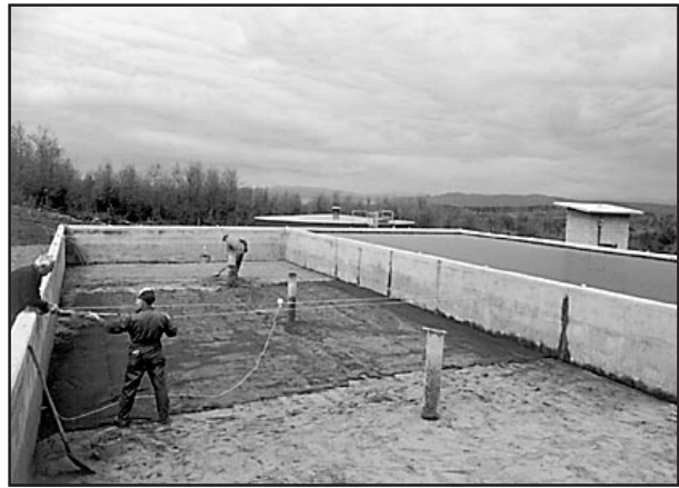
Photo 8-2. Slow sand filter, with schmutzdecke being scraped.

In a slow sand filter, raw water passes by gravity through a bed of sand, about 36 inches deep, which is supported underneath by a layer of gravel. Filtered