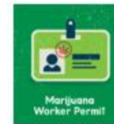
Marijuana Worker Permit