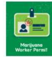
Marijuana Worker Permit