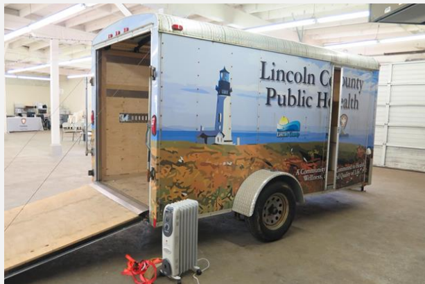
Lincoln County deployable MRC Team supply trailer

During the Echo Mountain Complex Fire, the MRC worked with Red Cross volunteers and Public Health Nurses to stand up a medically fragile shelter for those who required low level medical care.