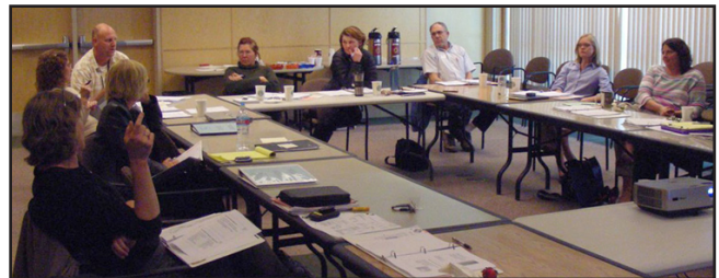
Oregon Public Health Division staff presented information on potential public health hazards during workshops held around the state in April and May.