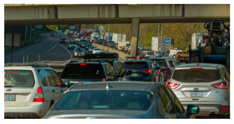
By 2040, Portland-metro households will spend an average of 69 hours each year stuck in traffic on the highways.