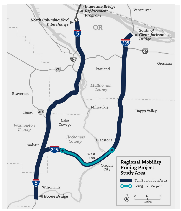
ODOT is studying how tolling on I-5 and I-205 can meet regional values. We'll also look at the best way to plan how to roll out tolling over time