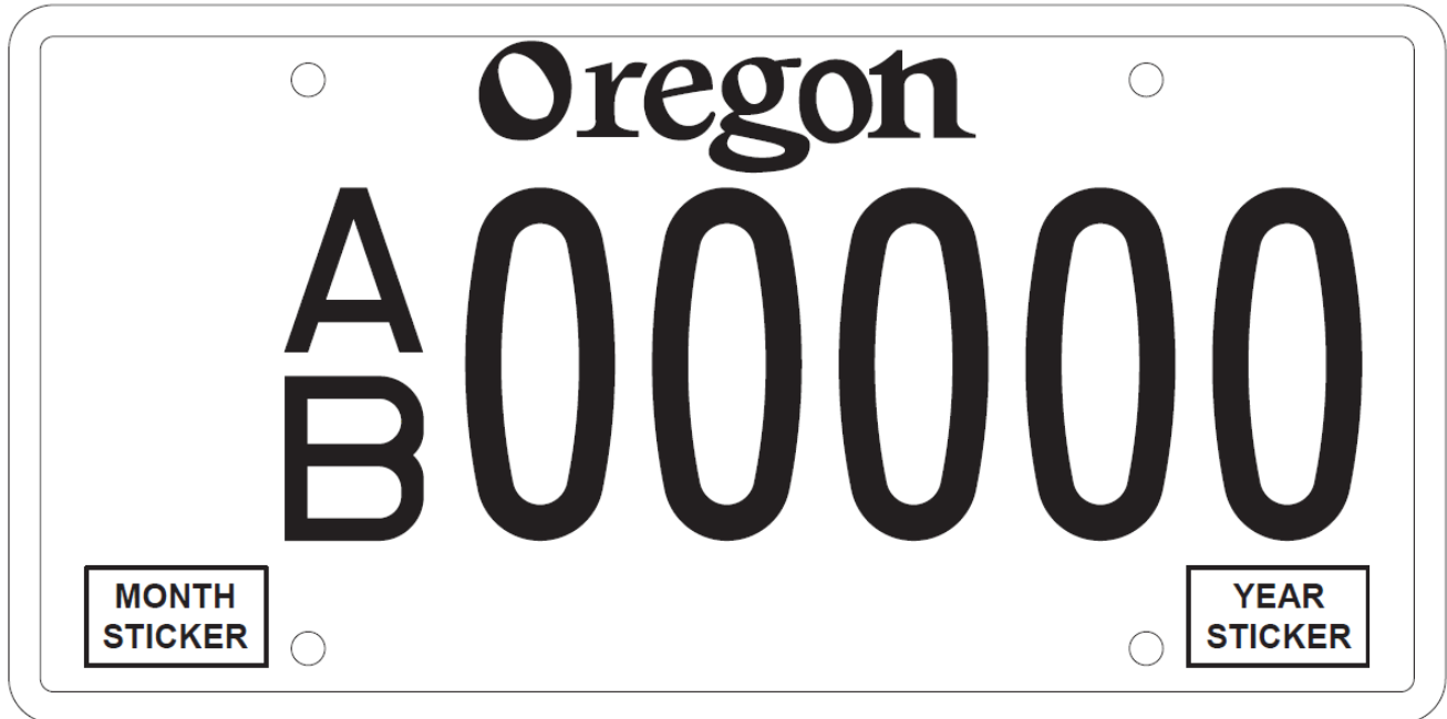
Plate Design Template Option 1

DMV will contact you if your plate design requires changes. If no changes are required or once changes have been incorporated and returned to DMV, DMV's plate manufacturer will create computer-aided design (CAD) drawings of your plate design for your review and approval. Once the CAD drawings are approved, DMV's plate manufacturer will produce actual plate samples. The sample license plates must be approved by authorized representative(s) of your group and law enforcement.