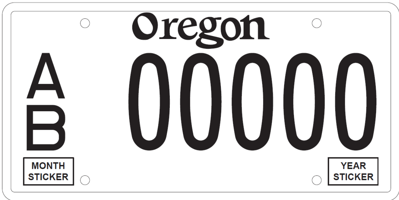
Plate Design Template Option 2

Your plate design must be clear and easy to read. Law enforcement and other emergency personnel rely on registration plates to identify a vehicle in the case of a traffic violation, crash or an emergency. Remember that DMV will consult with law enforcement and the plate manufacturer during the plate review process.